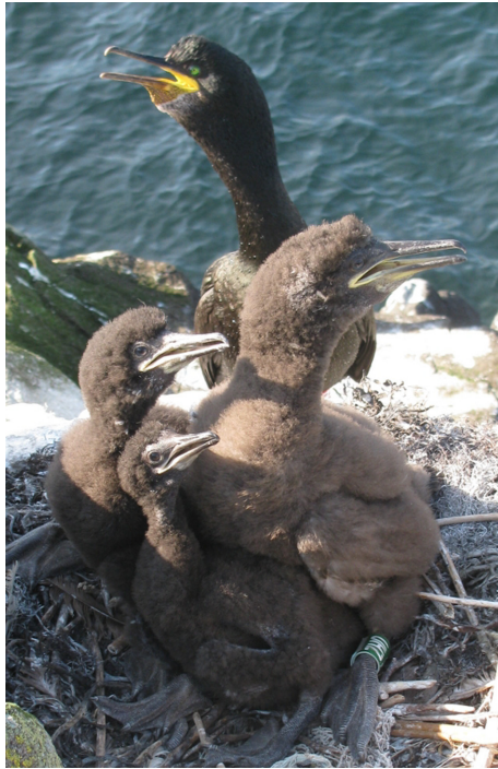
Figure 1. A brood of asynchronously hatched European shags ( Phalacrocorax aristotelis ), aged c. 25 days, with an attending parent.

investigate the effect of gastrointestinal nematode infection on individual chick growth rate and survival in a system where we can disentangle the confounding effects of parasite distributions between related individuals. We also investigate whether these differences arise as a result of changes in parental resource provisioning to the whole brood or to changes in how resources are allocated to different members of a brood.