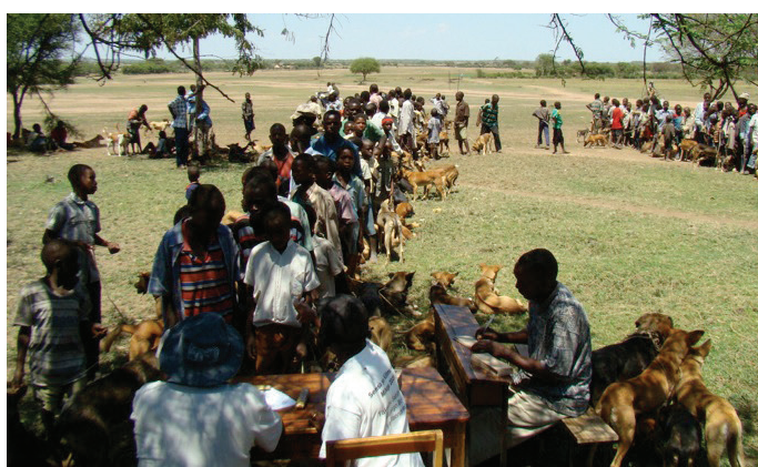
Mass dog vaccination underpins the success of canine rabies control and has been shown to be feasible in most settings in Africa and Asia. Here, owners wait in line to get their dogs vaccinated by an NGO-funded programme in Matongo village, close to the Serengeti National Park in Tanzania