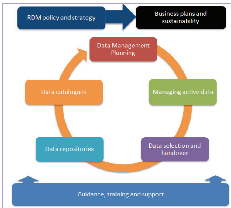
Fig. 3. Components of Research Data Management service, Digital Curation Centre 20

Mitigating action can be taken by encouraging the use of open and standard data formats, but the biggest challenge arguably is in understanding just how much we as a central support team can and should provide services to researchers versus how much researchers should be supported in developing their research practice to manage research data appropriately. Fig. 3 illustrates the components of a research data management service.