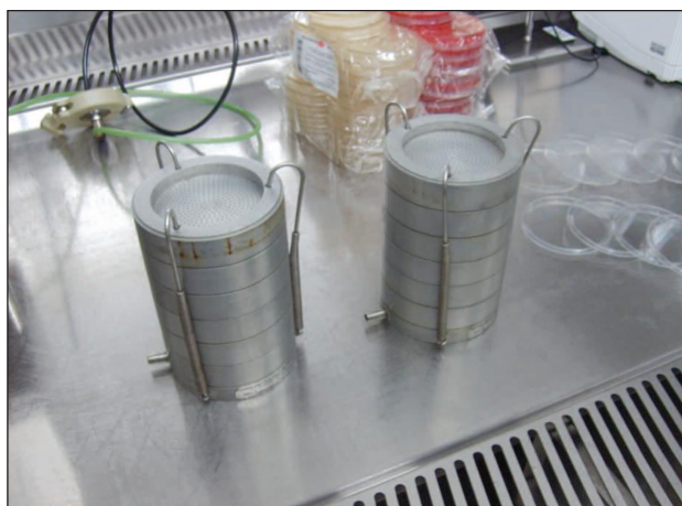
Figure 2. Six-stage Andersen air samplers.

stage has an agar plate below it and the impaction velocity onto each agar surface increases down through the stages and, as the air passes down through the stages, the size of particle that is efficiently deposited onto the agar plate becomes smaller. This allows the median diameter and size distribution of the MCPs to be calculated by the method given by Kethley et al. 7 . The size distribution is usually log-normal and hence a logarithm of the D50%, of the stage above, was plotted against the percentage cumulated counts calculated on a 'less than stated size' for each stage. A regression equation was obtained of the plot, and the equivalent particle diameter at the 50% cumulative count point determined. The values for the 50% cumulative particle size impacted on each stage of the Andersen samplers, in terms of equivalent particle diameter, were obtained from published results 4 , and are as follows: