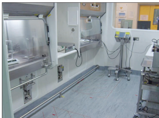
Figure 1. Non-unidirectional airflow cleanroom.

The BioVigilant Instantaneous Microbial Detection System (IMD-A-350) was positioned in the cleanroom. This system samples air at a rate of 28.3 L/min (1ft 3 /min). The air is drawn into the unit and then enters a 'concentrator', which uses the principle of a 'virtual impactor' described by Hinds 4 . Most of the particles are concentrated into 1.15L/min of air and pass down through the centre area and into the interrogation zone of the IMD-A-350 system. The remainder of the air is exhausted perpendicularly from the side of the concentrator, at a rate of 27.2L/min, and passes through a HEPA filter and vented from the system. The particles that enter into the interrogation zone are counted and recorded in the exact same manner as a standard particle counter. To permit direct comparison with the number of particles counted by a standard particle counter, these are referred to as 'total' particles in this article. This also distinguishes them from the 'biological' particles, although a number of the total