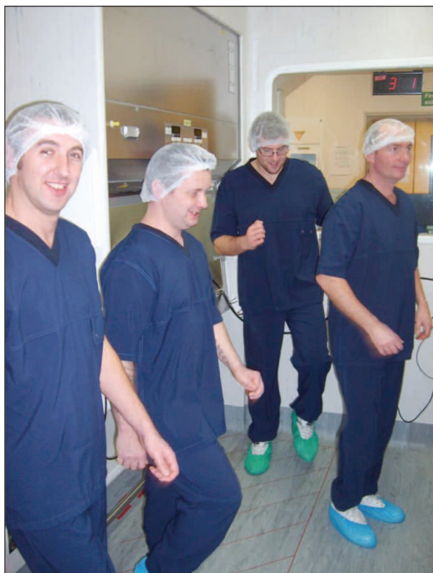
Figure 4. Testing in cleanroom undergarments.

(15ft 3 ) of air, and the microbiological media plates were removed and incubated. This process was repeated a further two times (three tests in total; Tests 1, 2 and 3). The full cleanroom testing attire is illustrated in Figure 3 .