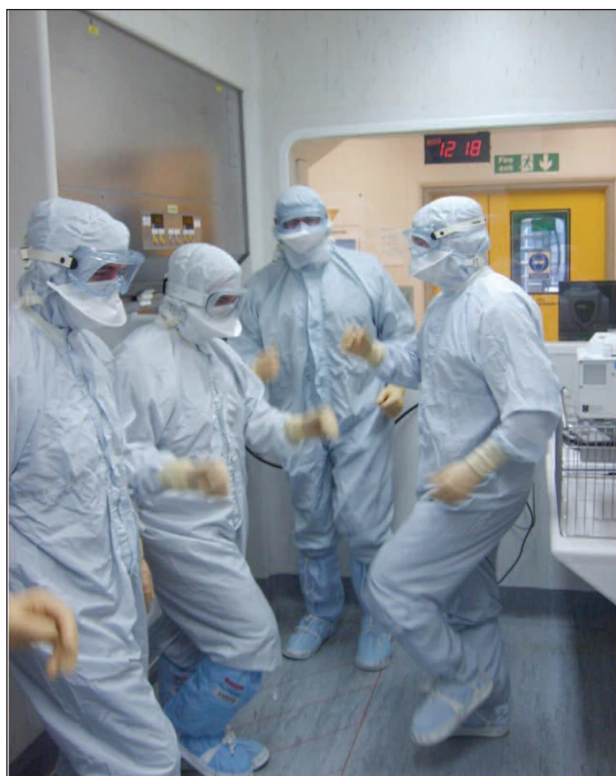
Figure 3. Testing in full cleanroom attire.

(15ft 3 ) of air, and the microbiological media plates were removed and incubated. This process was repeated a further two times (three tests in total; Tests 1, 2 and 3). The full cleanroom testing attire is illustrated in Figure 3 .