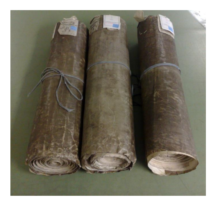
FIGURE 1 (below): The three copies of the Ragman Roll at The National Archives, Kew, C 47/23/3–5

Because of the comprehensive nature of the Ragman Roll, which provides a panoramic snapshot of the property-holders of Scotland in 1296, it is a source of utmost importance for The Breaking of Britain and the prosopographical database of medieval Scotland which forms part of the project. Little, if anything, has been written, however, to explain the process by which the three copies of the roll were produced.