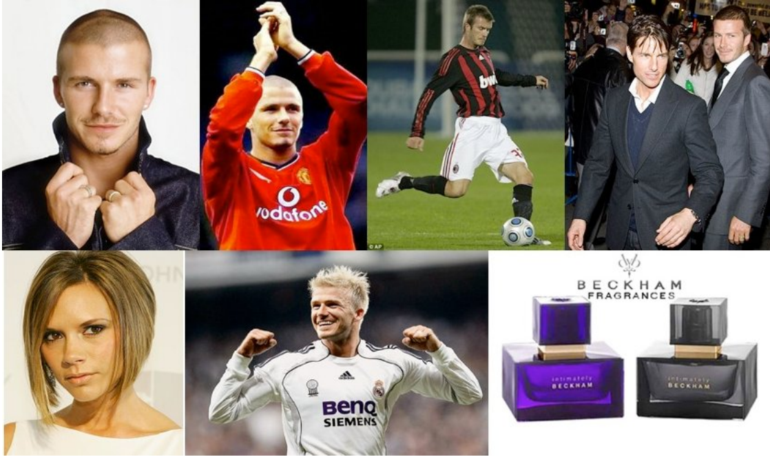
Figure 2: Sample Images in Different Dimensions Related to “Beckham” topic

a F -measure. However, this measure might not be suitable to benchmark the results when the results are mixed together from different algorithms intended to diversify the results from different aspects. The question is how can we measure the performance of diversity algorithms. If an algorithm performs better or worse, from which dimension do we get the gain. Ideally, evaluation measures, i.e. S-recall, should either investigate the clusters within the same dimension or we should find a new method to evaluate diversity over several dimensions.