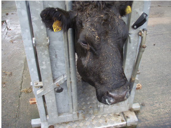
Figure 1 Unilateral facial swelling in a 10-year-old Limousin cross cow.

concentrations were slightly elevated; the albumin/globulin ratio was decreased. No abnormal findings were reported on bacteriology and parasitology of a faecal sample. Bovine virus diarrhoea (BVD) antibody detection was positive but virus detection was negative. Johne's disease serology was negative.