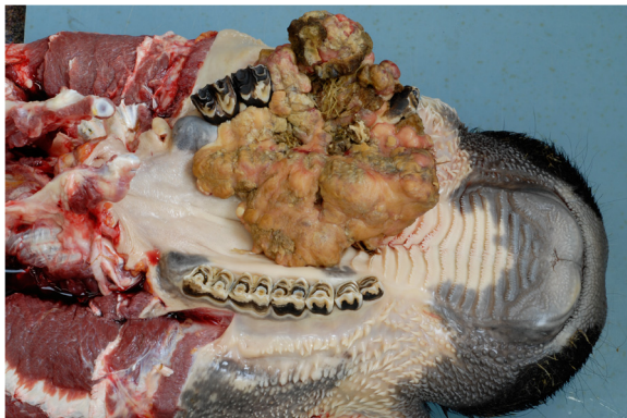
Figure 2 Oral mass protruding from the right maxilla.

Culturing of samples taken from the mucopurulent nasal discharge isolated the following bacteria and fungi: Trueperella ( Arcanobacterium pyogenes ), Pseudomonas aeruginosa , Staphylococcus epidermidis , Streptococcus spp. , and Candida spp. A small superficial section (1 × 1 cm) of the mass was removed for bacteriological and histopathological examination. Culture results of the mass indicated sparse cultures of Streptococcus spp. , Staphylococcus epidermidis and Weeksiella virosa . Histological results showed infiltration of fibrous tissue with inflammatory cells, many of which contained bacteria. No signs resembling Actinomyces bovis were found, sulphur granules were not observed. Neoplastic cells were also not observed in this initial tissue sample.