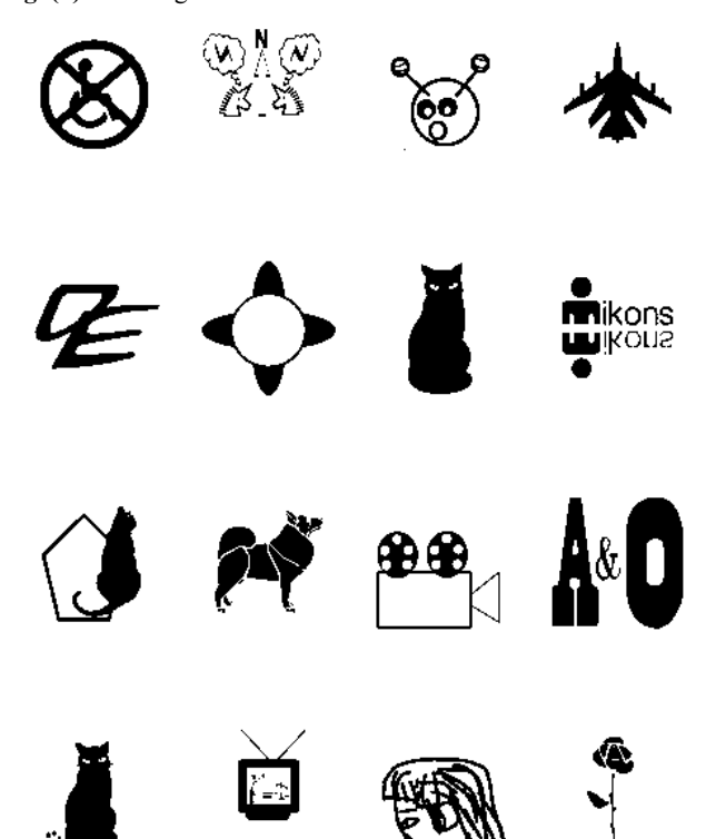
Fig. (3). A Collection of Mikons.