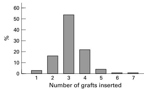
Figure 1 Breakdown (%) of the numbers of grafts inserted at coronary artery bypass grafting in the study patients.

ation. 19 The patients in the study were younger (mean age 58.2 v 60.7 years, p < 0.001 ) and were from areas of higher socioeconomic deprivation ( p < 0.001 ) compared with all patients in the health board area undergoing CABG during the same time period, but had a similar sex ratio. Comparisons with the UK CABG population of 21 568 patients undergoing CABG surgery during 1995/6 23 also confirm the similar sex ratio, but patients in the present series were younger (58.2 v 60.6 years, p < 0.001 ).