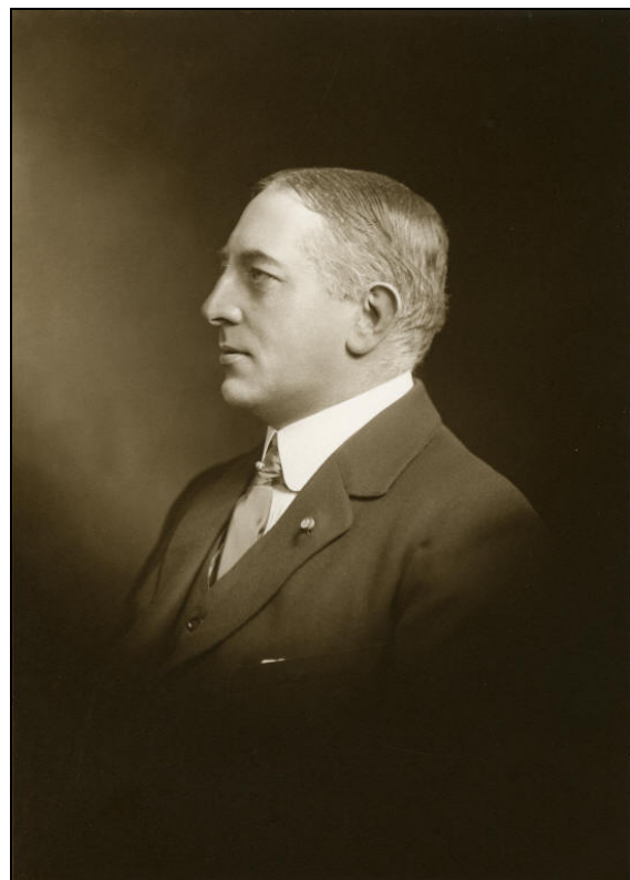
2) John Burnet (1863-1928)