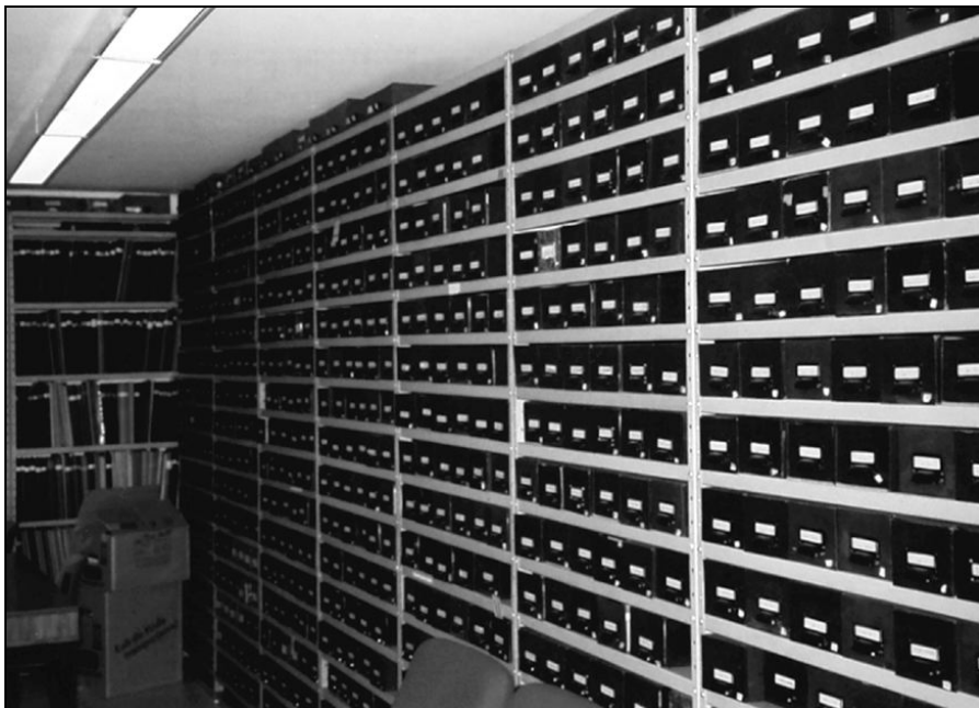
4) Lexicon card file in the Platon-Archiv, Philologisches Seminar, Eberhard Karls Universität Tübingen November 2006