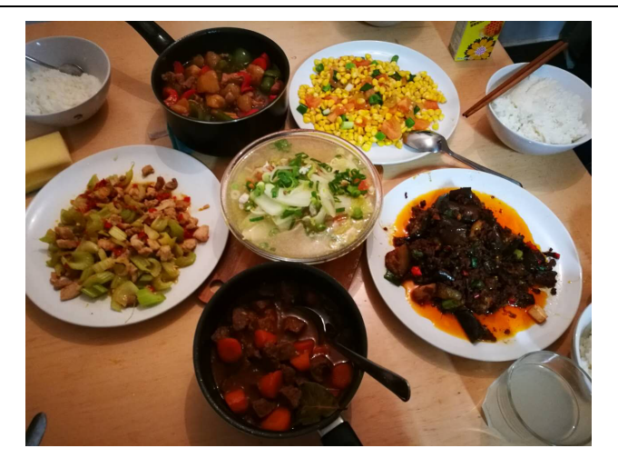
Figure 2: "Tasty food" from Wendy (F-Bus-1)

As seen in Figure 2, Wendy missed the food from home, but, more importantly, the atmosphere of home, where Chinese friends could "cook altogether" rather than "with yourself". Co-national social connections could be helpful to ease feelings of loneliness and homesickness (Cai et al., 2019), but Chinese students in this study felt lonely and homesick again shortly after spending time with fellow Chinese students. Therefore, Chinese PGT students in this research explored a variety of coping strategies, such as contacting family and friends in China or developing new hobbies.