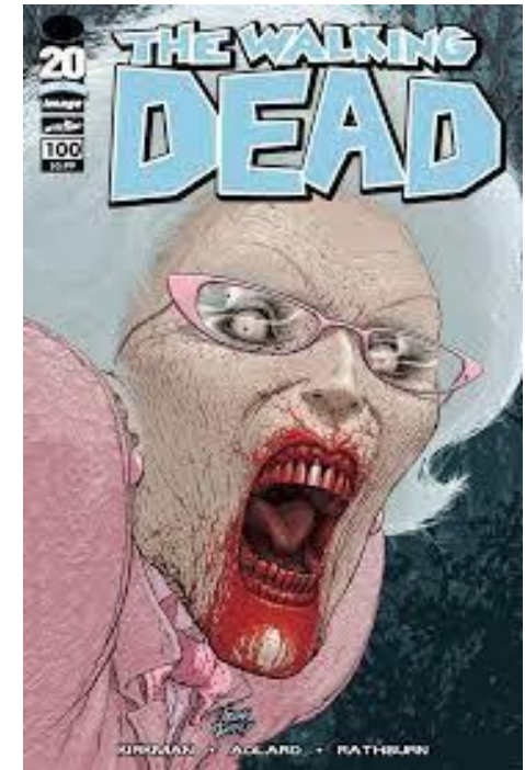
F. Quitely, The Walking Dead