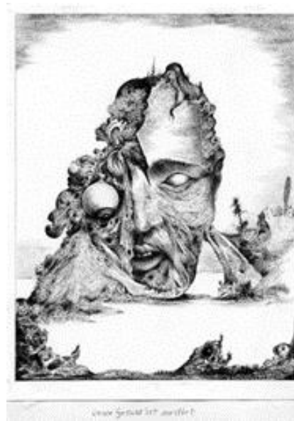
C. W. Rauh, Unser Gesicht ist zerstört