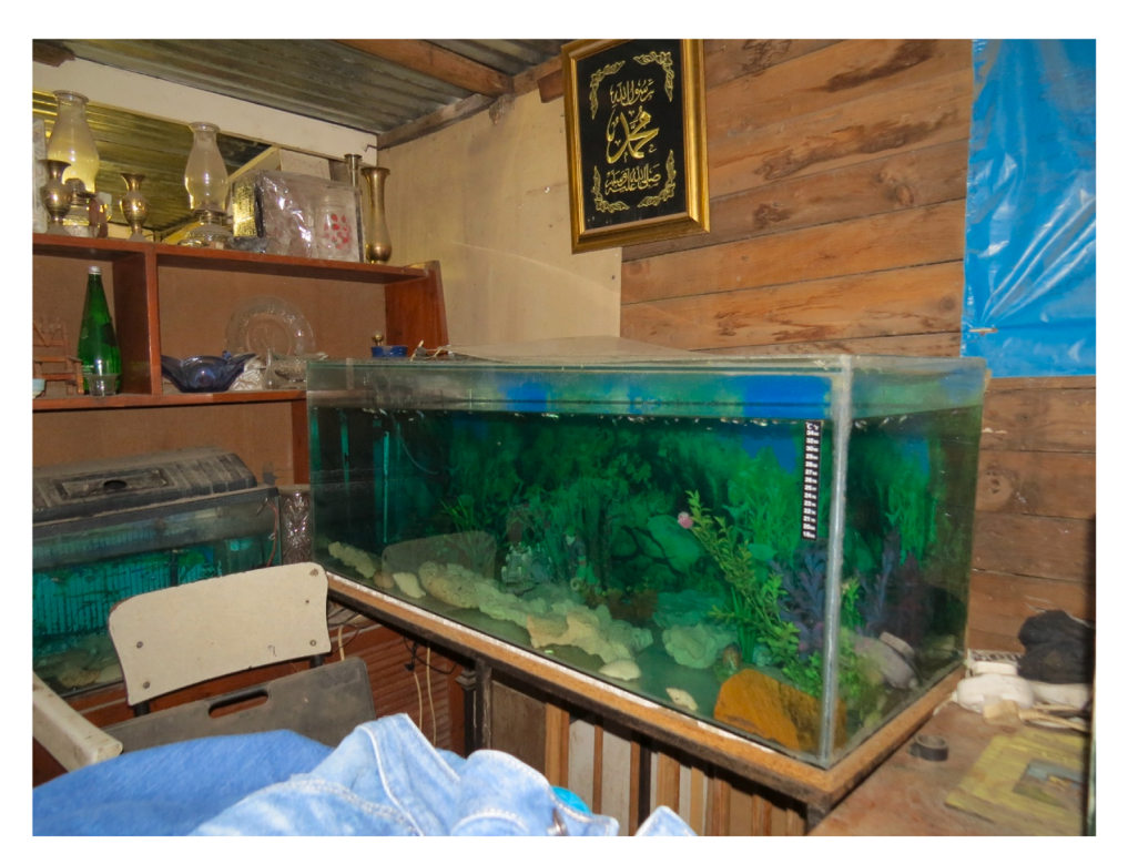
Fig. 9. Fish tank, by Aqeelah.