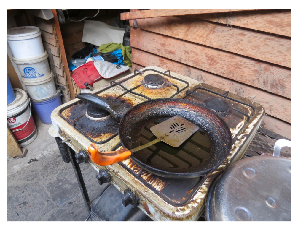
Fig. 3. Frying pan on the gas stove, by Aqeelah.