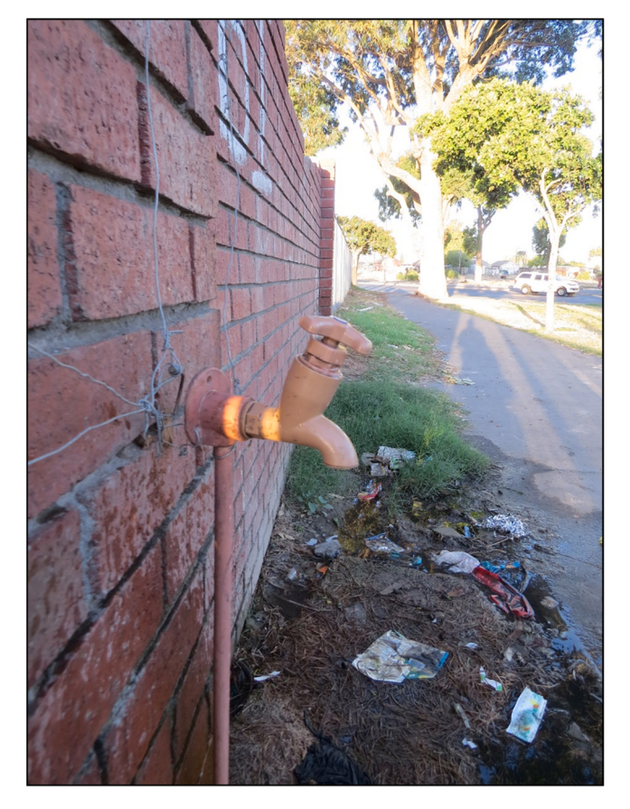
Fig. 8. The secret place, by Zintle.