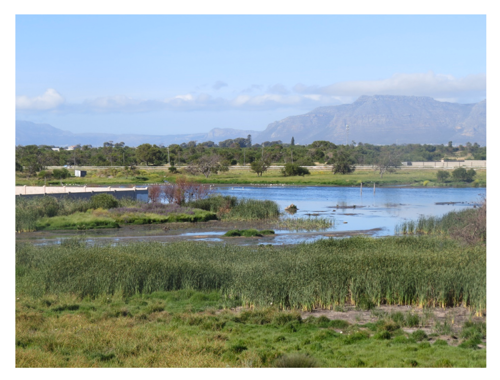
Fig. 4. Playing field, by John.