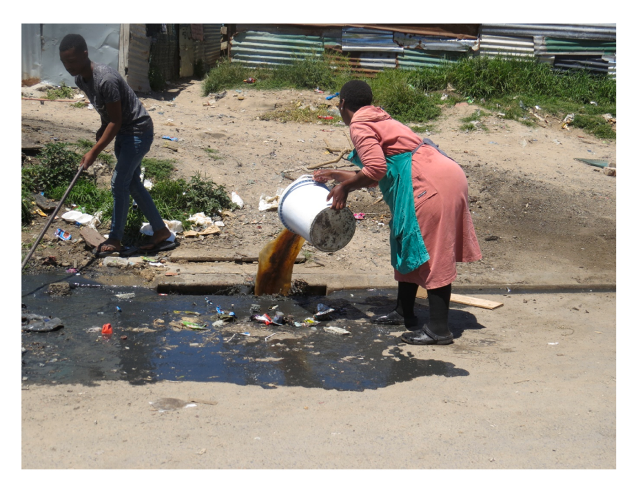
Fig. 1. Drains blocked by fat from food waste, by Nomtha.

Photographs and captions created by participants across the three sites show the ways in which repeated (and in some cases permanent) exposure to hazard can shape relations between people. Some images show positive dynamics, such as when people work together to rebuild burnt-out shacks. However, a more common dynamic emerges in photographs that focus on the causes of the challenges that residents in these and similar places face. For example, a repeated visual theme in Sweet Home Farm is images of people throwing things out of buckets and/or down drains, as in Fig. 1.