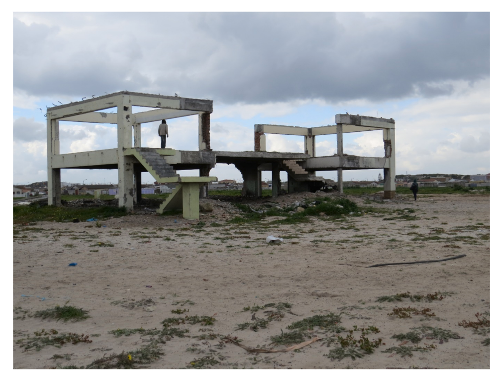
Fig. 6. The challenges of fighting fire, by Chevon.