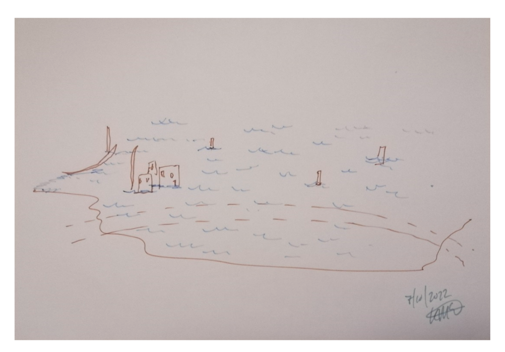
Fig. 10. Imagined future of Grangemouth.

stories. Some of the stories reveal an understanding of the water-related risks facing certain places: for example, Waterfront View imagines that in 2010, the narrator made the conscious decision to buy a house that was close, but not too close, to water. In the future of the story, they now sit 'on our front step with our morning cuppa, watching the ducks splash in the water at the end of our ever-reducing garden' (EF, Scottish Central Belt, October 2022). Spaces previously striated by streets and buildings are rendered smoother (and so riskier) by the rising waters.