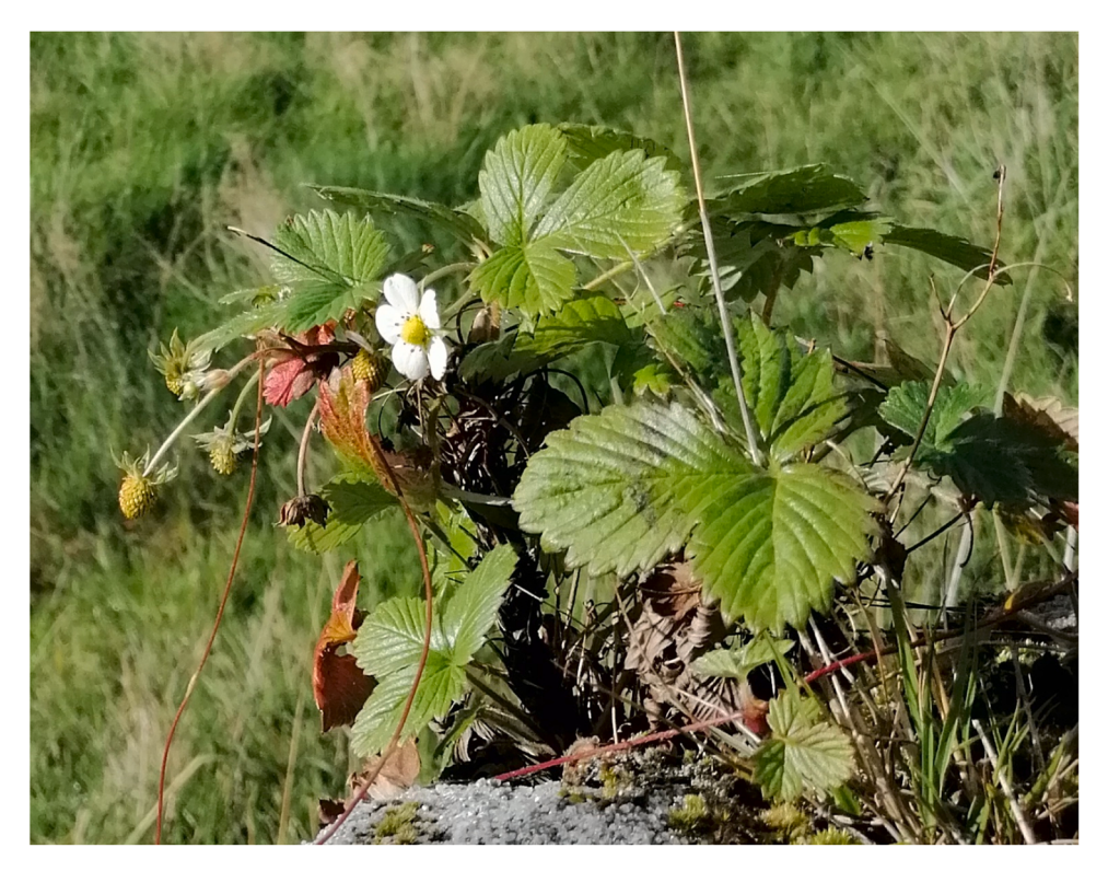
Fig. 11. Wild strawberry in October 2022, anonymous, Scottish Central Belt.

Taken as a whole, the stories shift between visions of flood and visions of drought – and as foreshadowed in the stories of future tensions described above, some of them also envisage changes to vegetation, whether in cultivated gardens and fields or in less tended spaces. Another story of a familiar walk, Spring in Autumn, demonstrates the author's recognition that the seasons are already changing: Contributed anonymously following the workshop in the Scottish Central Belt in October 2022, the story takes the form of a map of a circuit walked daily by the author. This habit-worn line of articulation is broken by photos of spring flowers and summer fruit ripening in mid-October (Fig. 11) that indicate the risk of 'the entire assemblage ... [being] swept up by these vectors or tensions of