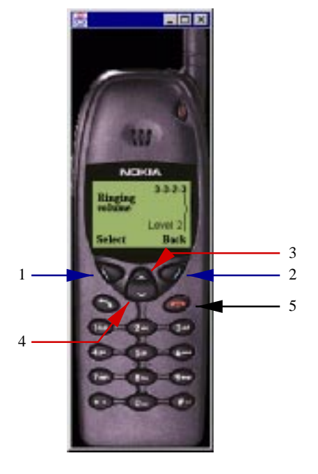
Figure 1: Java window containing the simulation of the Nokia 6110. On this picture, the size of the window has been scaled down. The simulation has the same size as that of the real device.

go back up one level in the menu hierarchy), respectively. These two buttons consitently allowed users to go up and down in the hierarchy. Buttons 3 and 4 are used to scan lists of items at a given level of the hierarchy. It is important to notice that the interface allowed users to loop over a list of menus. Button 5 allowed users to jump to the top of the menu from any position within the menu.