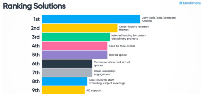
Fig. 4. Ranking of solutions identified.

culture. Research leadership and reporting within faculty structures was identified as an issue, where in some instances leadership can become either too dominant or too weak, thus closing down opportunities for a collaborative culture. A lack of opportunities for researchers to spend time together, whether this be ad hoc opportunities or cross-faculty events, was noted as a possible challenge. There is an additional challenge of people attending and prioritising structured sessions and events that are run as and purposely set up to be cross-faculty. Another perceived challenge was the time to prioritise research generally.