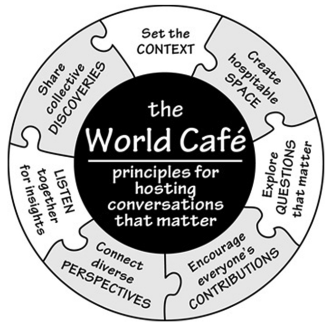
Fig. 1. Principles for hosting World Cafés

Fig. 1, below, outlines the seven principles for hosting World Cafés. All participants are viewed as experts by their own experience. Diverse