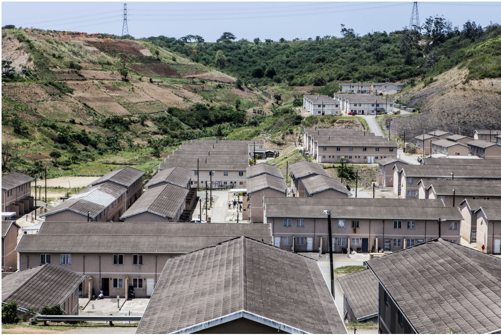
Figure 2. Housing at Hammond's Farm.