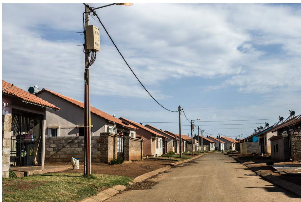
Figure 1. Street scene from Lufhereng.

The significance of many of the positive gains of formal housing is legible only through a relational analysis of former housing conditions, commonly typified by precarity and material deficiencies. This comparison is critical to the argument for disruptive re-placement. Yet this relational summary of gains tied to formal housing does not capture its corresponding disruptive and injurious features (see Meth, 2020) evidenced through a critical evaluation of the destination sites. Failings include the often incomplete and poorly built nature of the housing, woefully challenging peripheral locations, and the