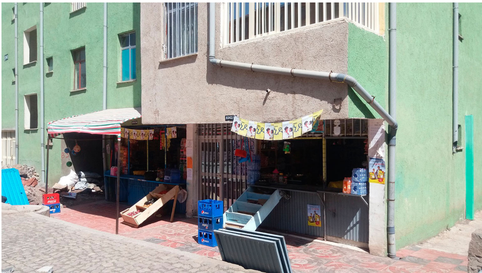
Figure 3. Retail at Tulu Dimtu.

Critical policy questions pertaining to the temporalities of a developmental agenda arise. For how long can conditions be endured by residents, and how can these be avoided altogether? Recognizing that urbanization has historically been forged through frontier practices that are predicated on political gain, disruption, loss, lawlessness (McGregor & Chatiza, 2019), danger and scarcity, what extents of temporal disruptions are acceptable, reasonable and avoidable? Furthermore, when these are state-produced disruptions, over what time period, if any, are injurious impacts ever acceptable? Urban spaces are dynamic. Once-peripheral locations can become desirably located. A planner involved asked "Who knows what might happen to somewhere like Lufhereng?"