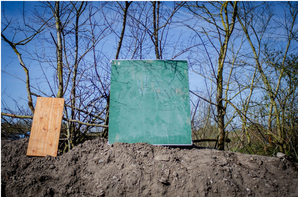
Figure 3: “2B Black is not a crime” written on a sign on the edge of the so-called Calais “jungle”, 2015. [Colour figure can be viewed at wileyonline library.com ]

If the violence of the camp in Calais can be stealthy, along Croatia’s borders with Bosnia and Serbia, a seemingly different violence operates, the hallmark of which