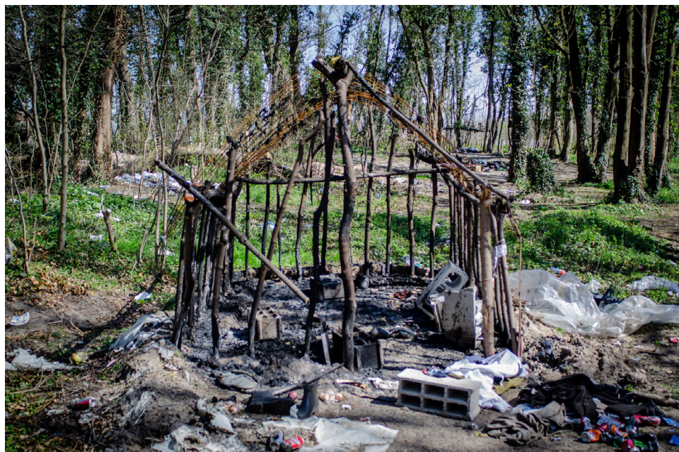
Figure 4: A refugee shelter on the outskirts of Calais recently destroyed by French police in a cyclical act of domicide. [Colour figure can be viewed at wileyonlinelibrary.com ]

The “Balkan Route” or the “Western Balkan Route”—as described by Frontex (El-Sharaawi and Razsa 2019)—came to prominence as immigration to Europe peaked during 2015. Our fieldwork indicates that the Balkan Route was initially an alternative to the more dangerous sea routes. Typically, refugees travelled from Greece, through Serbia, and then either through Hungary into Austria and then Germany, or through Croatia and Slovenia. Countries of the route themselves experienced outward and forced migration, particularly during the 1990s onwards, and this was felt acutely in Bosnia where the Muslim population was