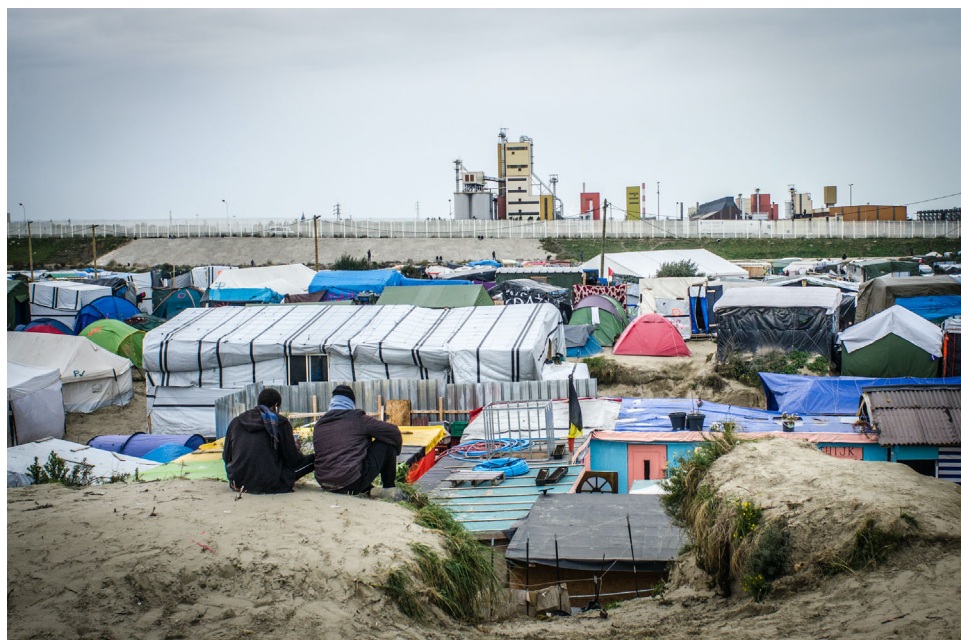
Figure 2: Two residents of the Calais “jungle” look out across the camp, with chemical factories in the background. [Colour figure can be viewed at wileyonlinelibrary.com ]

Of course, the French government and local prefecture did not ascribe a racial motive to these acts of violence. Nor too, would the status of “violence” be ascribed to the systematic denial of sanitation, water, and food to subaltern people, the vast majority of whom originated from former European colonies, or “the