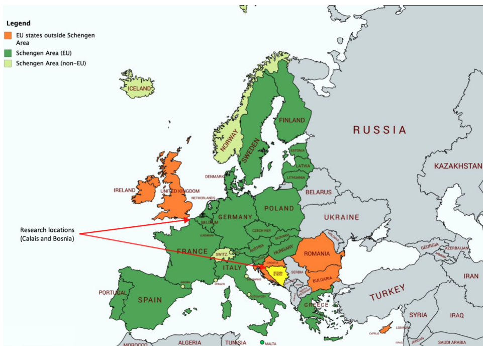
Figure 1: Map of Europe showing case study locations. At the time of writing the UK was still part of the EU. [Colour figure can be viewed at wileyonlinelibrary.com ]

It is in this space that our paper makes its contribution. This paper looks at the two aforementioned case studies of border violence used to securitise EU borders and suggests that although such acts of violence differ in manifestation, they