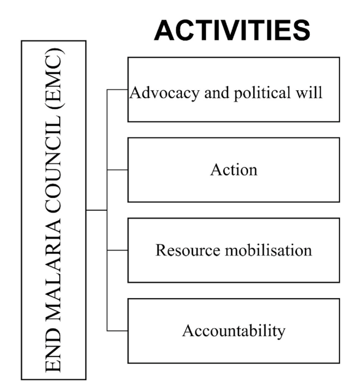
Fig. 2. A diagram showing the activities of the End Malaria Council [16].

objectives of the current national malaria strategy plan (2021–2025) are met with the minimum possible limitations and impediments [10].