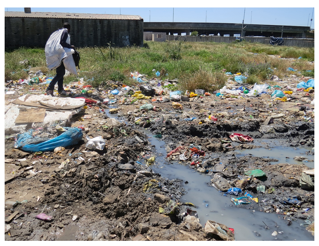
Fig. 9. Ncebakazi's photograph, "Dumping sites".