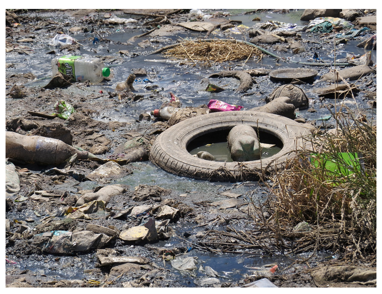
Fig. 12. Nomtha's photograph, "It seems as if SHF never existed on the Western Cape map".

presents itself as a place of nature and natural beauty. However, the greens of grasses, plants and trees are largely absent from Sweet Home Farm, and only figure significantly in images where the gaze is directed outside of the settlement. For residents in this settlement, nature is problematic rather than health-giving, encountered in the form of floods, wind, insects, dogs and rats. The data reveal Sweet Home Farm as a bounded, enclosed space – a highly localised harmscape that may be dramatically different to neighbouring spaces.