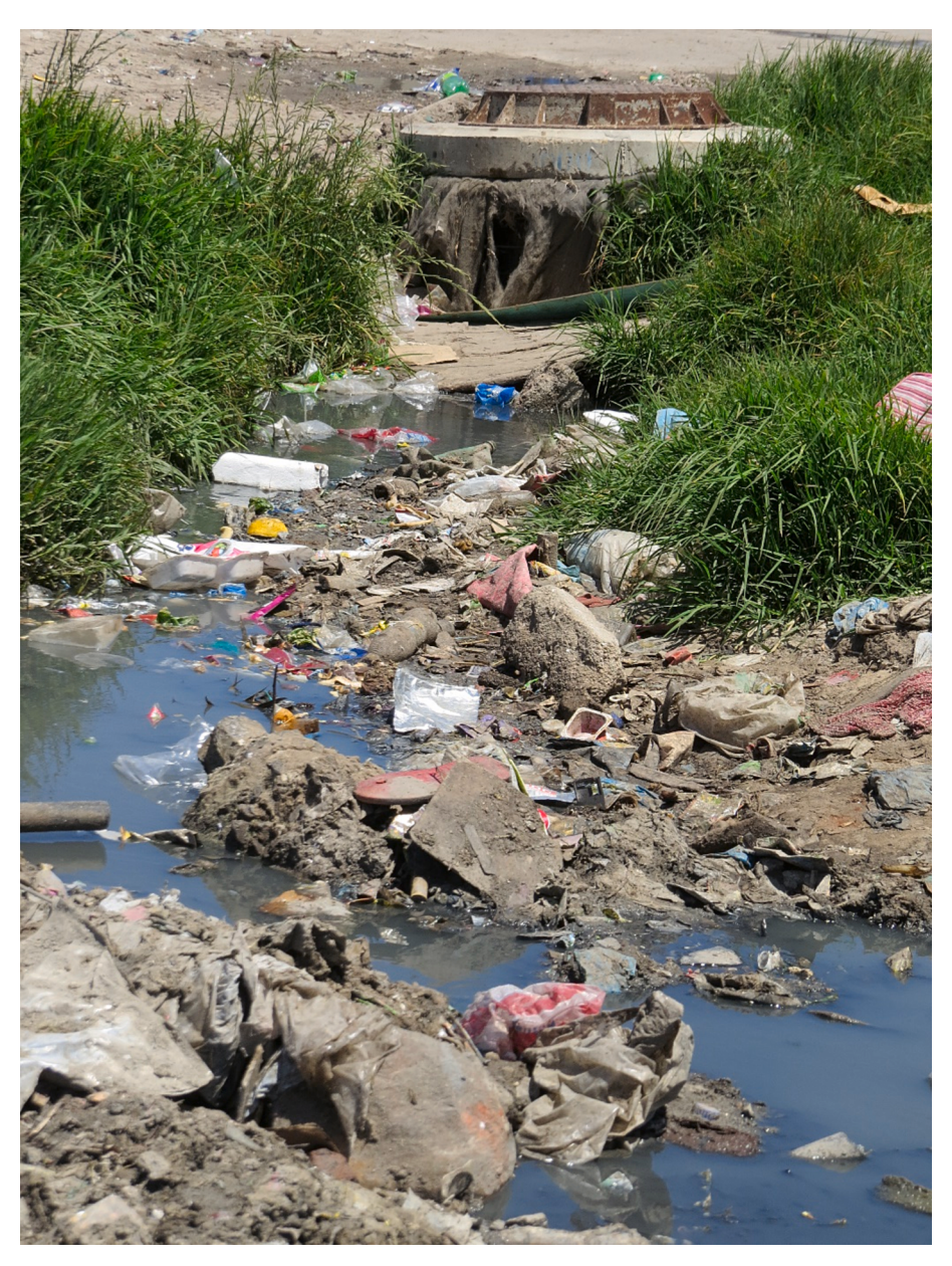
Fig. 4. Amanda's photograph, "Blocked drains".

'democratic' co-research processes (UKRI, n.d.). This stage of the project was conceptualised as a form of photovoice, a method that has been increasingly used in participatory action research with marginalized communities (Sutton-Brown, 2014). It also has resonances with body/place journal writing (Somerville, 2011), a process that seeks to 'creates a space between grounded physical reality and the metaphysical space of representation' (Somerville, 2007, p.150) and which thus has the potential to bridge different disciplines and ways of thinking in was that are 'imperative in addressing questions about human interventions in ecological systems' (ibid.).