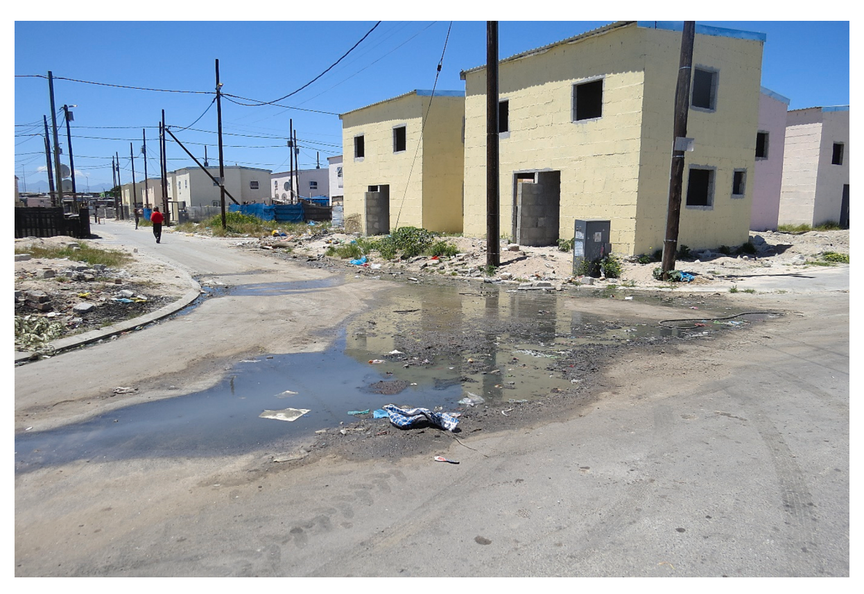
Fig. 10. Nomtha's photograph, "Unfinished development".

shows how the behaviour of others is thought to exacerbate flooding: