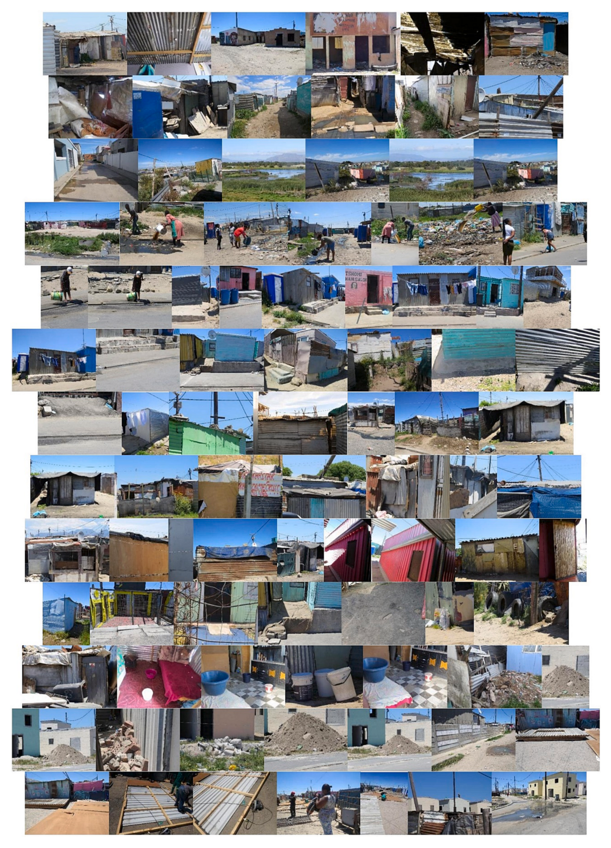
\textbf{Fig. 2b.} \ \ \textbf{Sweet Home Farm co-researcher photo assemblage continued.}