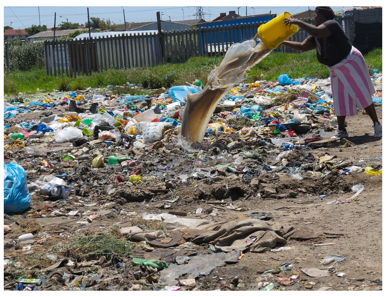
Fig. 8. Anele's photograph, "People throwing the rubbish".

Community members are blocking the drains by throwing dirty stuffs and when water can't flow to the drains, it will come to their houses and fill the roads. (Themba)