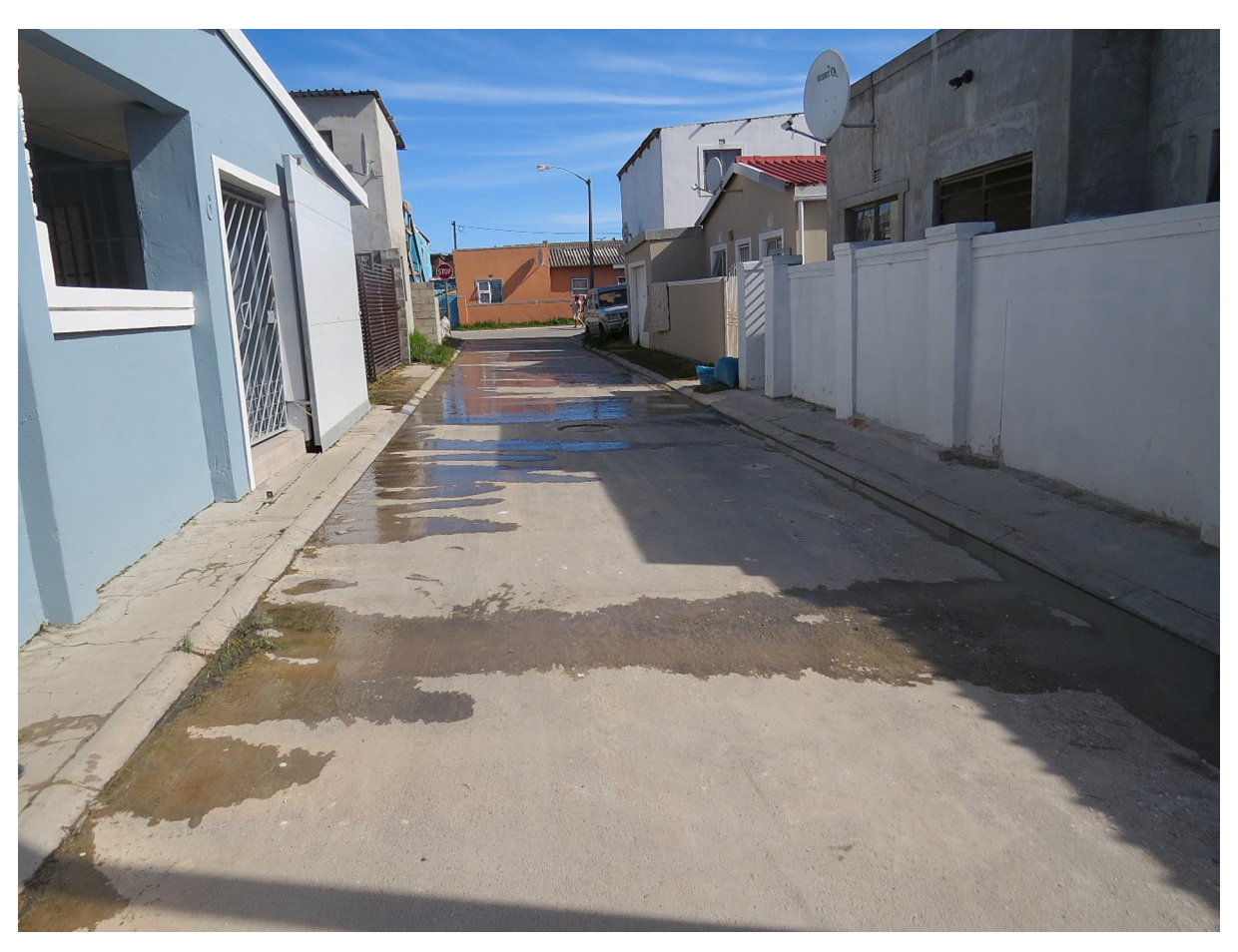
Fig. 3. John's photograph, "Houses on water".

Deleuze's ideas about learning are perhaps a natural fit for discussions of place-based learning and the development of landscape literacies. In Deleuze's (1994) work, he relates learning to experiences of difference and repetition, where difference is understood as a positive relationship rather than a lack or absence. Deleuze describes learning as taking place through three different types of synthesis arising from experiences of repetition and difference (Deleuze, 1994; Williams, 2013). The simplest of these is the passive synthesis exemplified by habit. This is the synthesis of a series of repeated actions or experiences, which might be related to learning in a continuous present. The second type of synthesis is that of pure memory, which creates relationships between temporally separated events: 'it implies between successive presents non-localisable connections, actions at a distance, systems of replay, resonance and echoes, objective chances, signs, signals, and roles that transcend spatial locations and temporal successions' (Deleuze, 1994, p83). Both passive syntheses arise from our capacity to notice or become aware of similarity within a repeating but varying series of similar events, observations or experience. In contrast, Deleuze's third type of synthesis relies on pure difference: '[i]t is a synthesis that produces a break, that erases the past and creates the possibility for a radically different future' (Wilson, 2021, p.909).