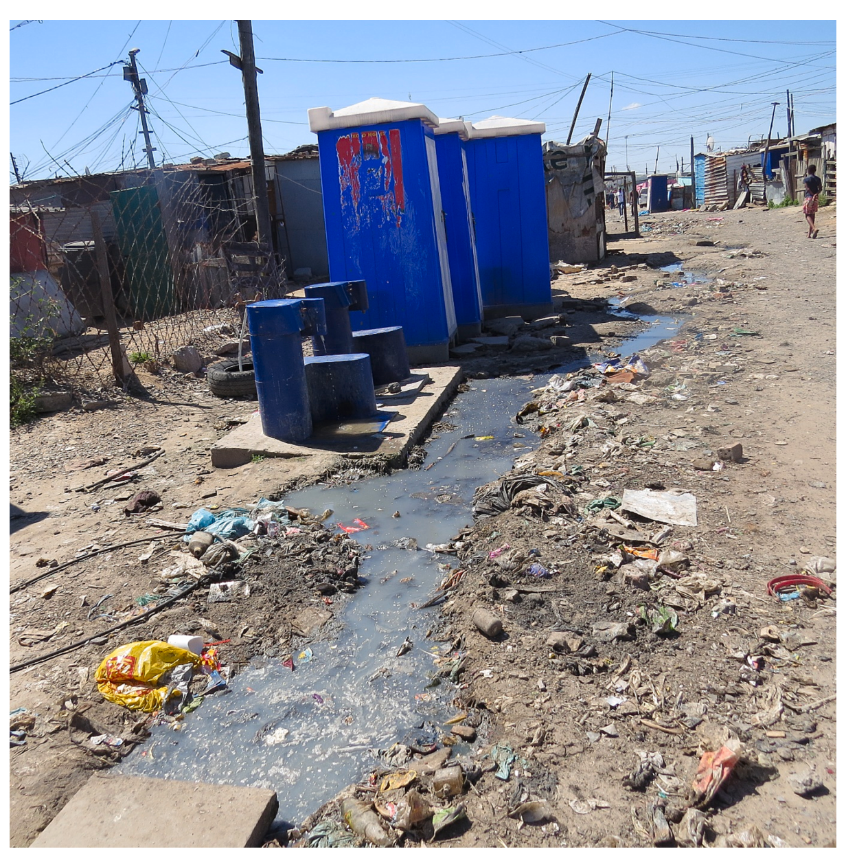
Fig. 5. John's photograph, "Leaking tap".

partial and thematic account of the landscape literacies being developed by residents: nevertheless, a powerful pedagogy of place emerges.