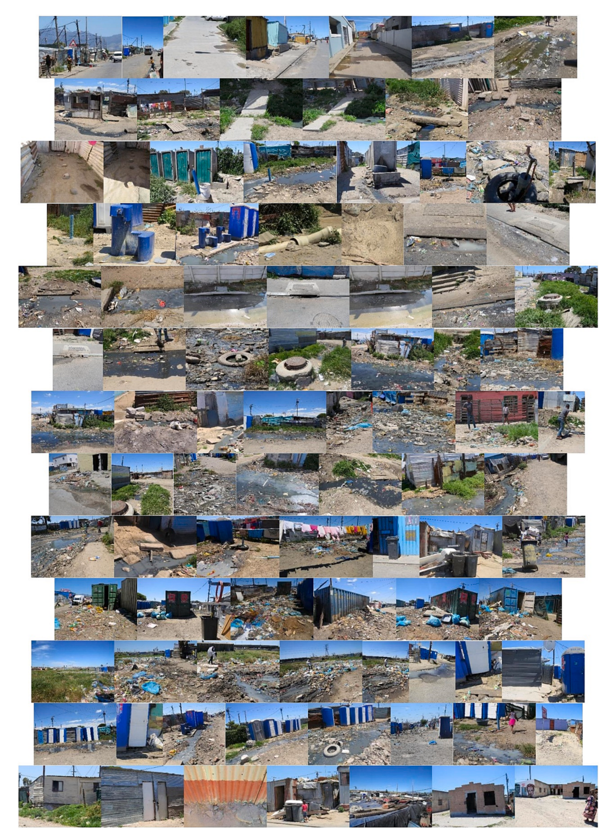
Fig. 2a. Sweet Home Farm co-researcher photo assemblage.