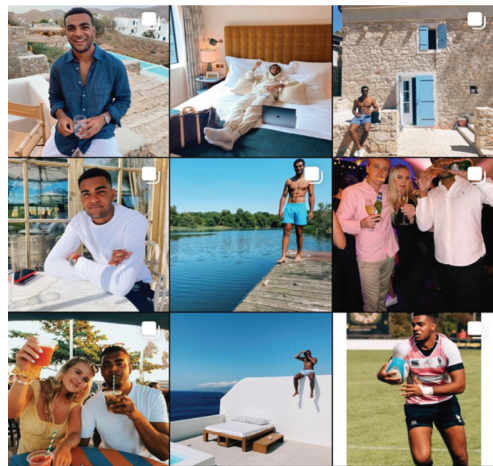
Figure 1. Comparing 9-tile visual storytelling across main and Finsta accounts. Source credit: permission received from participant to use original images and @handles.