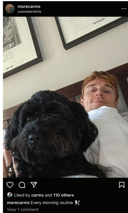
Figure 2. Comparing visual content on main and Finsta accounts.

I speak to the camera directly and more interactively a lot more ... I try to gain feedback and I check my secondary account DM's much more actively, because it's less overwhelming and it's more fun as the number of followers on there is much less. If the account had as many followers [as the main one] I wouldn't be able to talk to them all as I do. (Cameron)