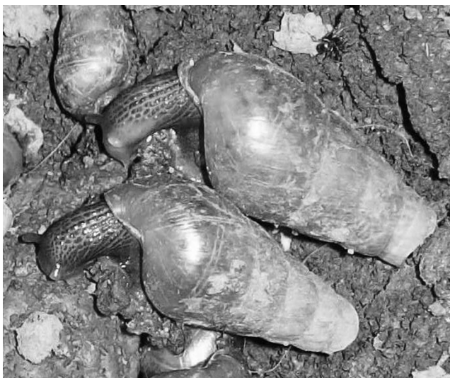
Figure 1 R. decollata snails feeding on buried feces from the open spaces of a public hospital, Autonomous City of Buenos Aires, Argentina.

pools (Fig. 2). The mean value of T. cati total larvae per gram of snail recovered in total positive pools was 5.1 larvae (CI 95%: -2.5 to 12.7), Mean value of total L3/pool was 8.4 (CI 95%: -8.8 to 25.6), and the maximum was 33 L3/pool. There have been sequenced two amplicons of 297 bp in length (Fig. 3) from individual larvae that were deposited into the GenBank database under Accession Nos. KR337264 and KR337265. BLASTN searches against GenBank reference sequences for T. cati with a query cover of 100% displayed high degrees of similarities (100–98%). The DNA sequence GenBank Accession No KR337264 in study revealed the highest nucleotide identity to T. cati (100%, GenBank Accession No. KJ777179; GenBank Accession No. AB571303; GenBank Accession No. AB110025; 99%, GenBank Accession No. KJ777163; GenBank Accession No. JF837172; GenBank Accession No. AJ002436; 98%, GenBank Accession