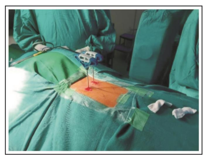
Figure 2: Jamshidi Needle in Pedicle.