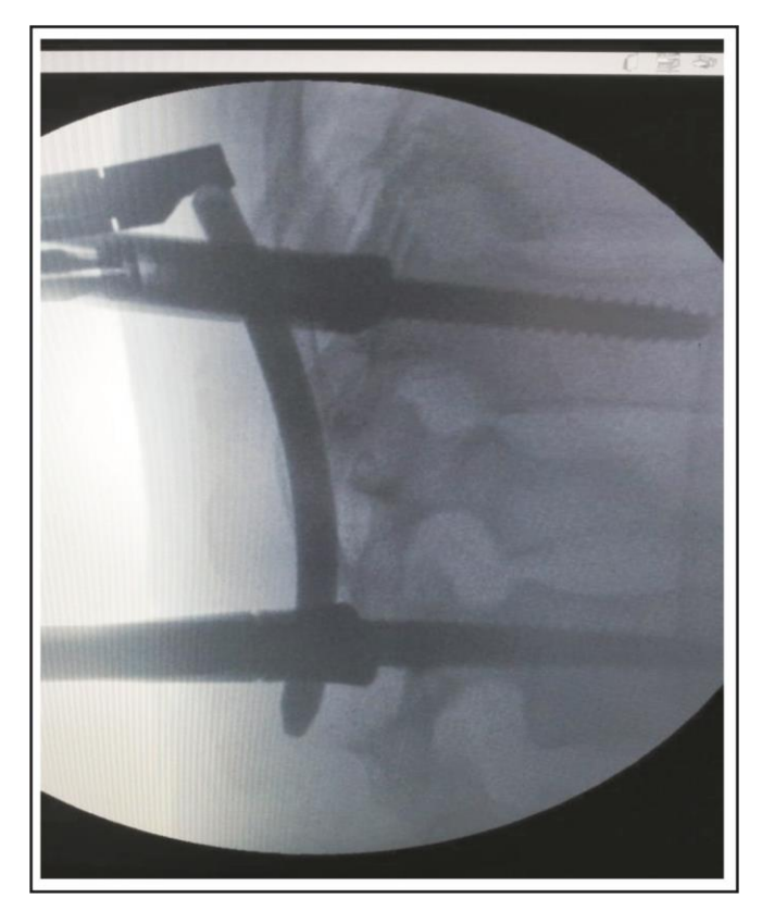
Figure 4: Connecting Rods.