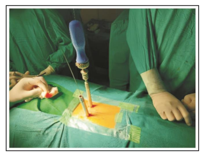
Figure 3: Sequential Dilators by Tapping Pedicle.