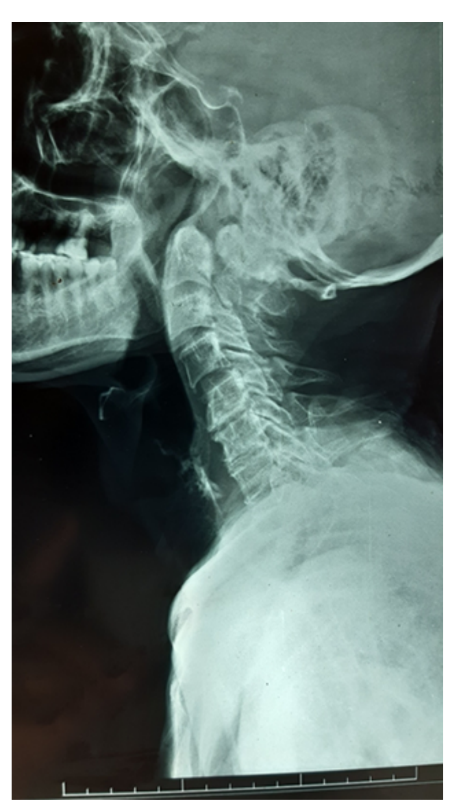
Fig. 1 Lateral X-ray cervical spine with craniovertebral junction instability with odontoid fractured and subluxation anterior to the anterior arch of C1 and cranially.

Upon admission to our department, Philadelphia Collar was applied the first day followed by skull traction for 2 weeks. After the initial 2 weeks he developed a pin site