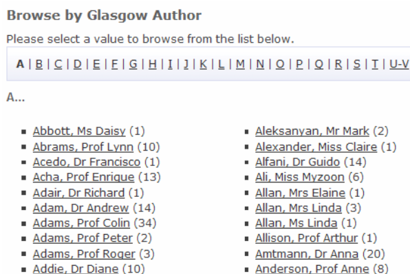
Figure 1 - Browse by Glasgow Author

In discussions with EPrints Services it was decided that a new, Browse by Glasgow Author view would be created. This view would use the author name in the user record rather than the cited name. This new view was dependent on the creation of the new user records.