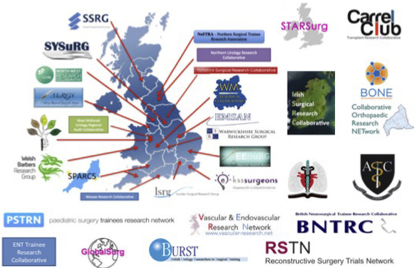
Fig. 1. Active trainee research collaboratives in the UK.