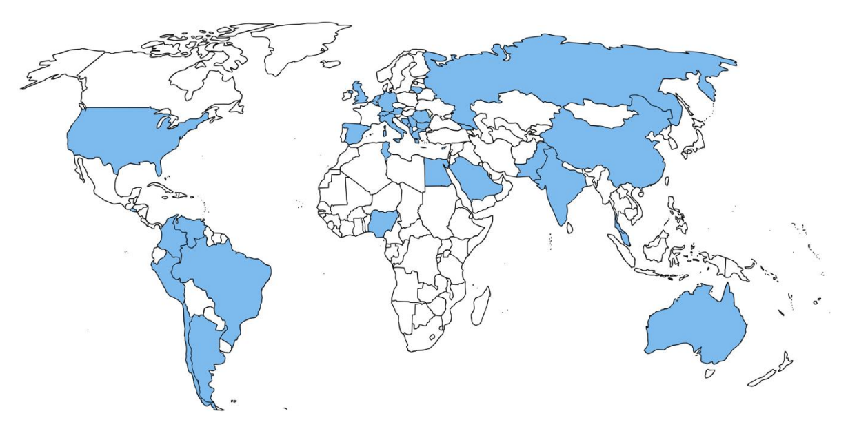
Figure 2. Participating countries.

The central management team contacted 35 collaborating research groups around the world. The countries participating in the survey are shown in Figure 2.