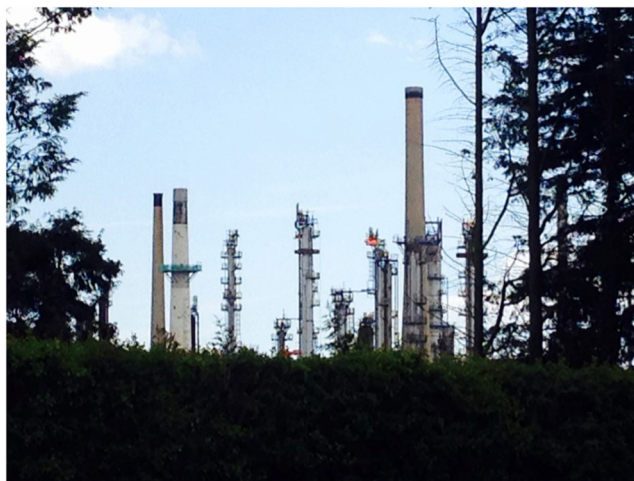
Figure 1. Fawley ExxonMobil refinery and petrochemical plant, viewed from Long Lane, Holbury, April 2016.

has slowly fragmented. Yet by and large, Esso has managed to contain local discontent, adapting its strategies of community public relations to address controversies, and invoking its historical, trusted role in the community. While there have been many local complaints about air quality, oil spills, and other incidents, there have been no sustained environmental protests around the site, relatively few public controversies or significant media attention, 1 and many local residents continue to place trust in the industry, while aware of the many incidents and risks. The case of Fawley complicates the understandings of the relationship between trust and risk, where public trust in a polluting corporation has endured on a general level, despite the cracks, yet public concerns and awareness of risks have also gathered pace, in bursts rather than continuously.