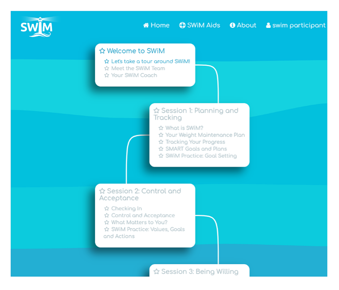
Figure 4. Screenshot of the SWiM (Supporting Weight Management) Aids tab. SMART: Specific Measured Active Realistic Time limited.

Figure 3. Screenshot of the SWiM (Supporting Weight Management) website showing the journey tracker. SMART: Specific Measured Active Realistic Time limited.