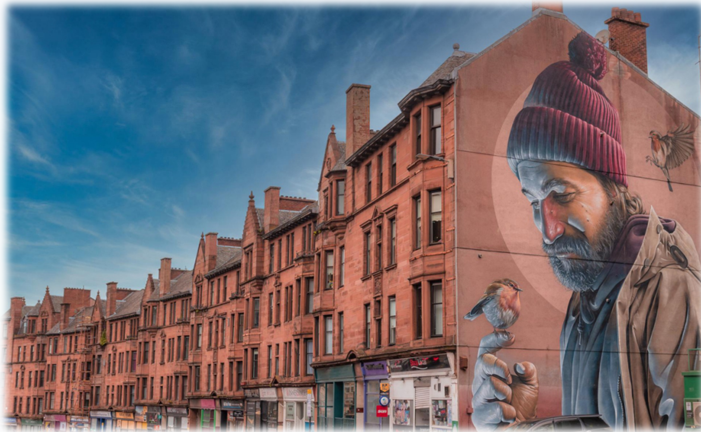
Glasgow High Street St Mungo's Mural (Smug, 2016)

Education is always a political act, which can be used both to maintain the status quo and to promote social change.