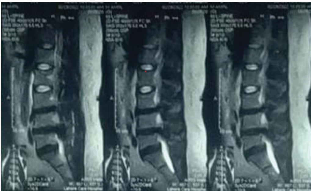
Fig. 1 Magnetic resonance imaging lumbosacral spine T2 sequence. Sagittal view showing lumbar stenosis most pronounced at L4/L5 and prolapsed intervertebral discs at L3-L4 and L5-S1.

A 34-year-old male presented due to our neurosurgery department with a long-standing history of lower back pain, which began radiating bilaterally to his lower limbs over the last 4 months. His condition had deteriorated further over the last 10 days with increasing pain, restricted straight left leg raising ability, and numbness at the L5 dermatomal territory in his left foot. Power was 5/5 (Medical Research Council scale) bilaterally, and reflexes were mildly brisk. An magnetic resonance imaging of the lumbosacral spine revealed lumbar stenosis most pronounced at L4/L5 and disc bulges at L3/L4 and L5/S1 (–Figs. 1 and 2). His visual analogue pain score (VAS) was now 6. The patient was a police officer whose symptoms now severely hindered his job, causing time off and stress, significantly impairing his