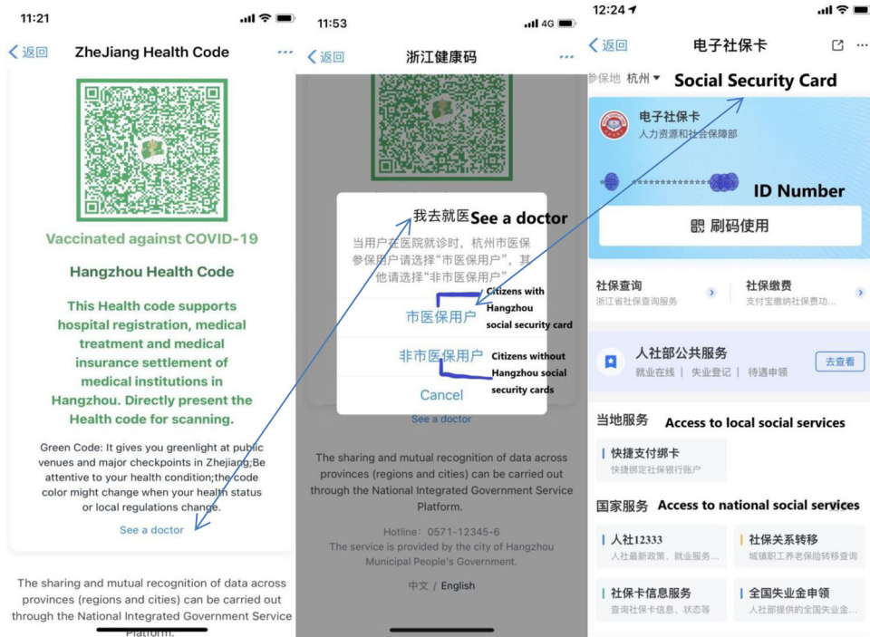
FIGURE 2 Health report and its use (walkthrough step 2)