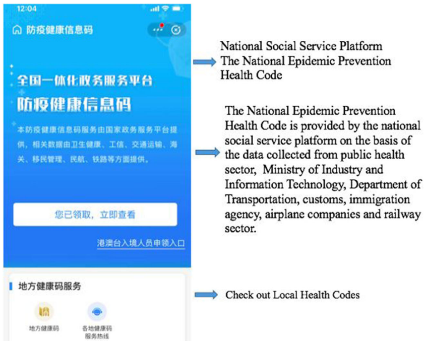
FIGURE 3 The national epidemic prevention health code (walkthrough step 3)

the national epidemic prevention code to guarantee that local governments can recognise the health codes through basic data sharing. In addition, another platform named 'Big Data Travel Card' (Figure 4) was developed and connected with the national health code system, tracking people's travel history, current location, and location history to help local governments determine one's health risks by using mobile phone real-time location data. JKM seems to follow the operational logic of Social Credit System (SCS), which connects multiple social, civic, financial, judiciary and mobility data systems (Liang et al., 2018).