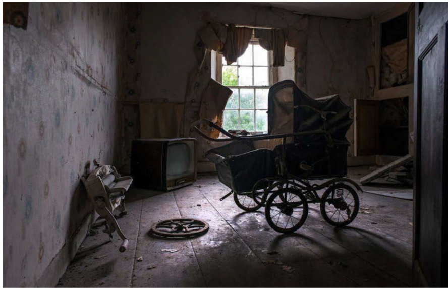
SIMON'S VICTORIAN PRAM

value in even the most mundane and everyday material culture that market actors may have overlooked and mention a vast range of discovered artifacts such as children's toys, perfume bottles, diaries, hairbrushes, furniture, and rosary beads. Simon's discussion of finding a Victorian pram (see figure 3 ), following a 4-year search, demonstrates how emotions are embedded in the archaeologist role: