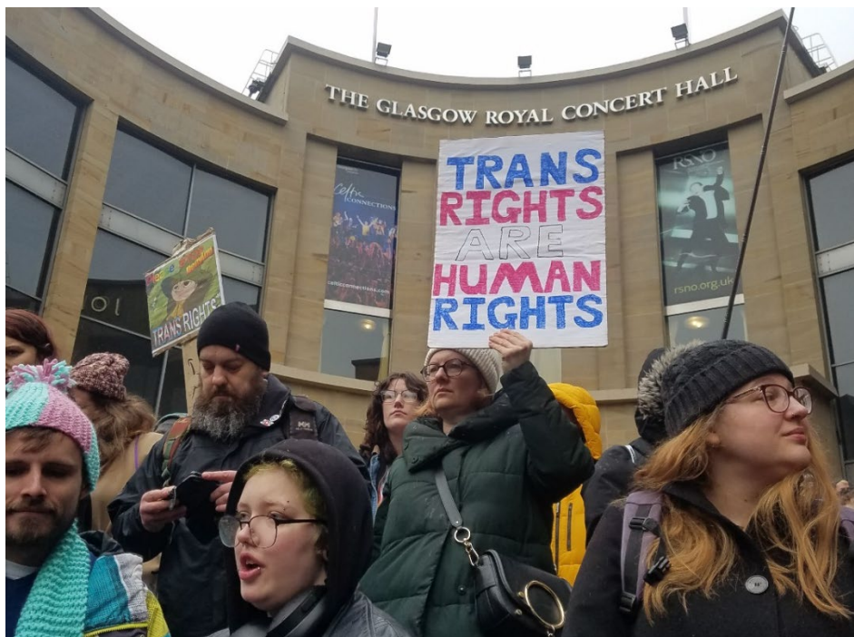
Note

Looking forward, there is much more to know about the micro-dynamics of crowds as identities. How much can a person’s identity be established through joining a crowd? Drawing an example from my own life, I remember my participation in an antiwar rally in Washington, DC on