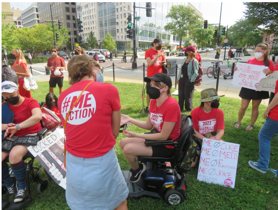
Note