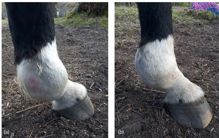
FIGURE 1 Photographs of the left hind distal limb swelling taken on initial examination by the referring veterinary surgeon (4 weeks after the traumatic incident).

Clinical examination and imaging findings were suggestive of a soft tissue mass, most likely composed of dense, yet poorly organised connective tissue. Options for further investigation such as magnetic resonance imaging and incisional biopsy were discussed, however, the owner opted to pursue surgical excision in the first instance.