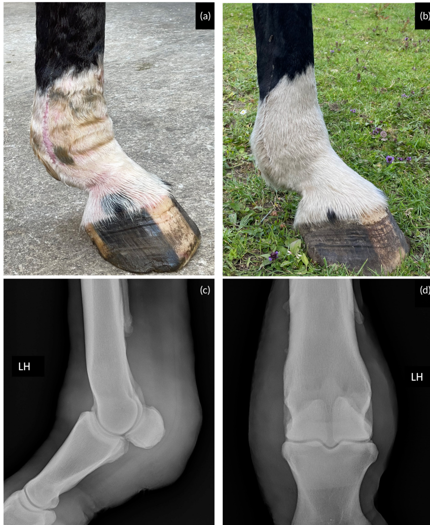
FIGURE 5 Photographs and radiographs of the left hind distal limb taken on reassessment by the referral centre. (a) Photograph taken at 9-month reassessment showing an incisional scar and minimal residual swelling present over the medial aspect of the left distal hindlimb at the level of the surgical site. (b) Photograph taken at 12-month reassessment showing similar findings to those observed at the 9-month reassessment. (c) Lateromedial and (d) dorsoplantar radiographs of left hind distal limb taken at 9-month reassessment showing evidence of minimal residual swelling on the plantar and medial aspect of the distal limb where the mass was previously excised.

fibrosarcoma specifically has been reported to be associated with vaccine-injection (Kannegieter et al., 2010) and burn injury (Schumacher et al., 1986). In this case, it is possible that the fibrosarcoma developed following the traumatic incident, whether trauma promoted growth of a pre-existing lesion, or whether the tumour was unrelated to trauma. Hyper-extension of the left metatarsophalangeal joint was detected on clinical examination; however, this was comparable with the right metatarsophalangeal joint and was reported by the owner to have been present prior to the injury, making this finding unlikely related to the fibrosarcoma. Differentiation of neoplastic processes such as sarcoid and fibrosarcoma from other lesions such as hyperplastic granulation tissue can be challenging (Findley et al., 2014; Hughes, 2007). Given the history of trauma in this case, nodular fasciitis, a reactive (self-limiting) lesion that occurs due to trauma, as described in dogs and humans, was also considered. However, the lack of