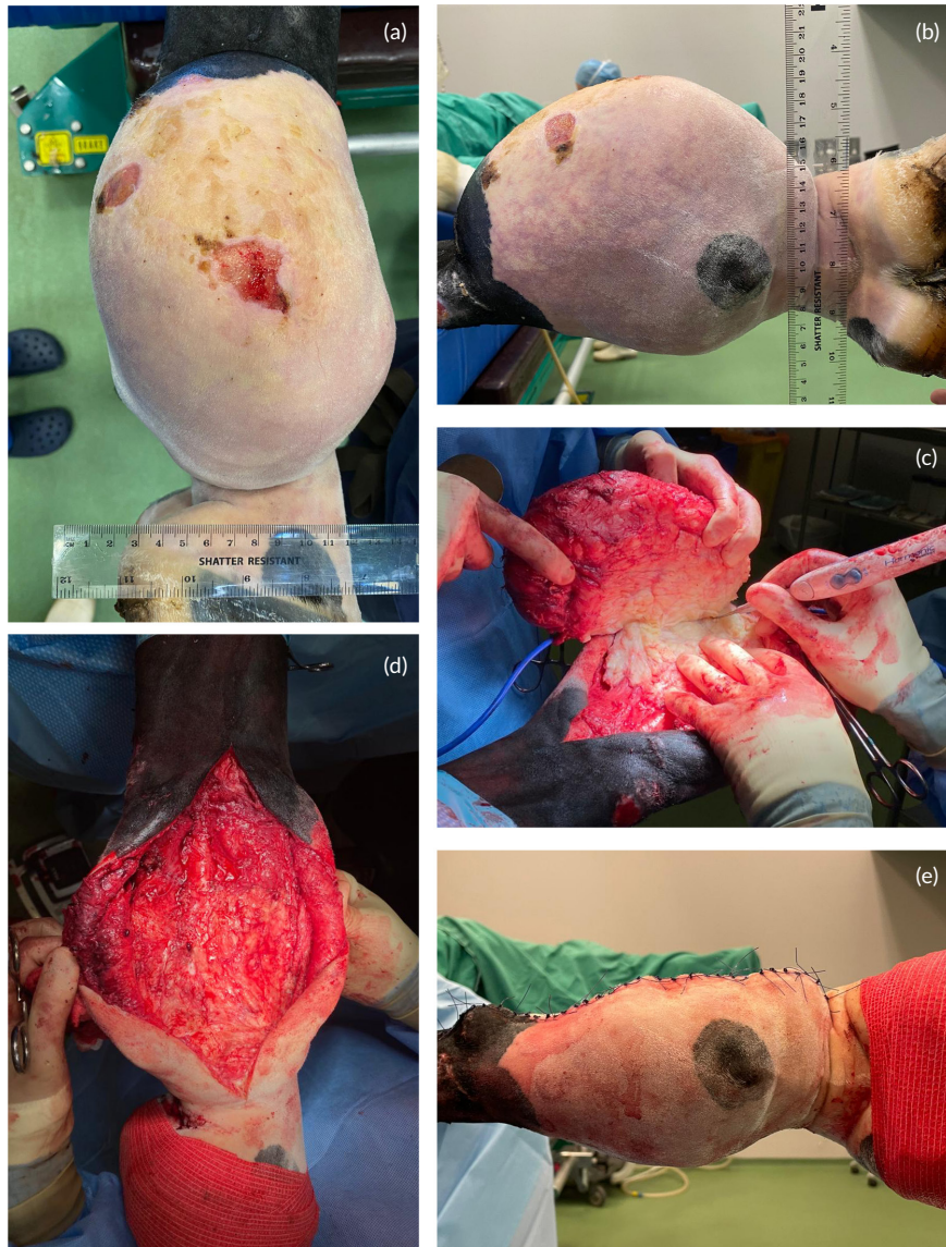
FIGURE 3 Intra-operative photographs. (a and b) Photographs of the large mass prior to surgical excision. (c) Photograph showing excision of the mass using a harmonic scalpel (HARMONIC SYNERGY™ curved tip blade, Johnson and Johnson International). (d) Photograph after excision of the mass. (e) Photograph following closure of the incision (three-layer closure).

iatrogenic damage to these structures. Minimal bleeding occurred during tissue dissection. After removal of the mass, the surgical site was lavaged and suctioned, and any excess skin at the wound edges was removed. Deeper layers of soft tissues and the subcutis were closed separately with a continuous suture pattern using No. 2-0 USP Polyglactin 910 (Vicryl, Johnson and Johnson International) and the skin was closed with a simple interrupted pattern using No. 2-0 USP Poliglecaprone 25 (Monocryl, Ethicon LCC; Figure 3e). A distal limb cast was applied to support the limb during recovery from anaesthesia as inadvertent iatrogenic damage to the suspensory apparatus could not be ruled out. The gelding had an uneventful rope-assisted recovery from anaesthesia.