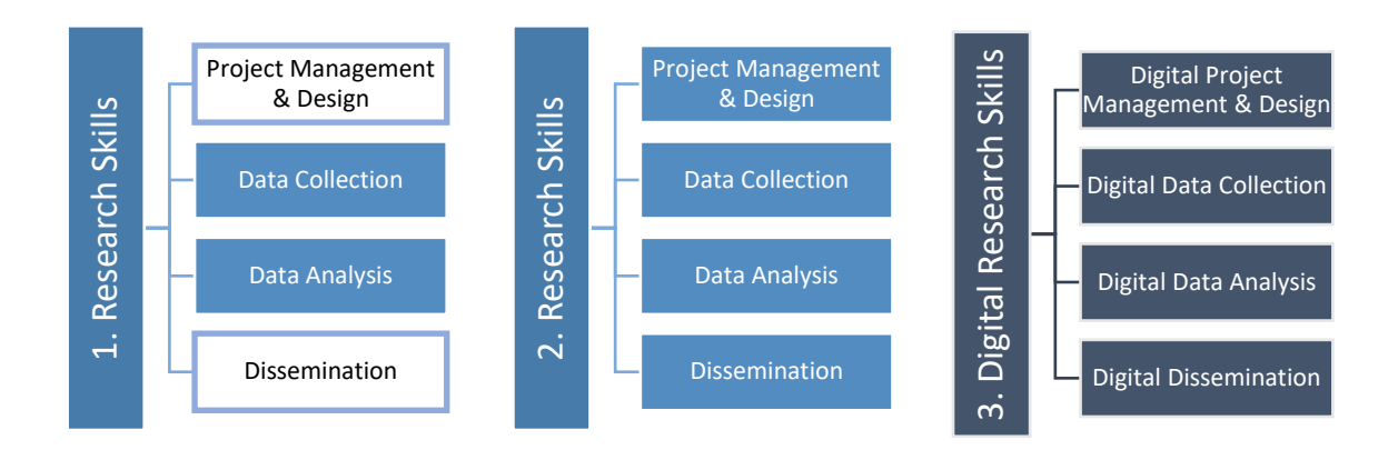
Figure 1 . Three 'pillars' required to produce skilled and confident researchers: 1. The current dominance of data collection and analysis in doctoral training; 2. The need to engage doctoral students with project management and dissemination strategies; 3. The need to embed digital skills throughout training. Adapted from the Ferrie Report: (Ferrie et al., 2022, pp. 2, 42, 63)

In terms of the future for teaching research methods, there must always be caution when extending the content of programmes unlikely to be given more space in the curriculum. What could be removed then, to make space for the whole-project approach? The strong skill-focused approach in 2015, has evolved in the 2022 guidelines which champions 'conceptual' understanding (ESRC, 2022). Following recommendations from the Ferrie Report (Ferrie et al., 2022), the 2022 guidelines encourage understanding the context in which data is produced and informed decisions about how data should best be collected, collated and curated depending on the particular research project. The recommendations focus not on removing specific skill learning, but about emphasising a holistic wholeproject approach allowing students to understand the project within the broader research context. From this foundation, students can then invest time learning the most relevant skills. Further, understanding data at this level is about research integrity. It is about an accurate representation of data and analysis as credible and robust. Here research integrity goes beyond reproducibility (which may focus on how data was collected or whether the analysis is repeatable) and considers ethics and whether the research is 'adding value' or is instead 'parasitic' (where research gains the authors' promotion or reputation and does not attempt to alleviate barriers to being and doing experienced by participants).