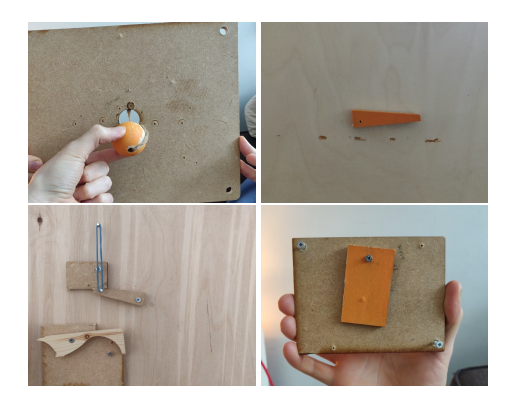
Figure 5: Prototypes B6, B7 (front and back) and B8

5.3.1 Building the Prototypes. For the third iteration, we deployed three prototypes (B6-B8, Fig. 5) that were bright orange in colour and sized such that the sakis could grip them easily. We chose the colour of the ball as orange because the sakis had earlier learned to react to this colour. Each button exhibited a different type of movement. Furthermore, B8 afforded movement mimicking a toy the sakis had used previously (a dog puzzle). B6 was a revised version of B4, comprising a pull button made of a wooden ball attached to a jute string. The ball was smaller than that in B4, facilitating easier movement, and the pull distance was longer (the ball could be pulled for approximately 15 cm). When released, the ball returned quickly to its original position tight against the plywood. B7 involved a lever button (a concept suggested by the keeper) built from wood, which sprang back into place after being pressed down. B8 comprised a movable wooden piece (a 'panel') mounted on an axle (a screw), hiding a red dot when in the neutral (downward) position. To see the colourful dot, the wood had to be moved. It