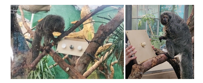
Figure 2: Testing prototypes B1 and B2

TEI '23, February 26-March 1, 2023, Warsaw, Poland