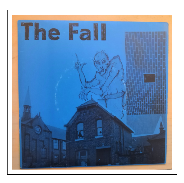
Figure 2. Front cover of the Fall's double A-side 'how I wrote elastic man/city hobgoblins'.

capitalism. Grotesque stratigraphy focuses less on discerning the vague atmospheres that 3D hauntology might direct us to and more on generating new desires from – as in 'originating in' but also 'out of' – place.