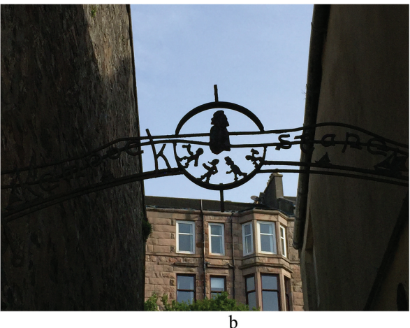
Figure 3. Ironwork sign 1 to the Kempock Stone' and 'Figure 3b Ironwork sign 2 to the Kempock Stone'.