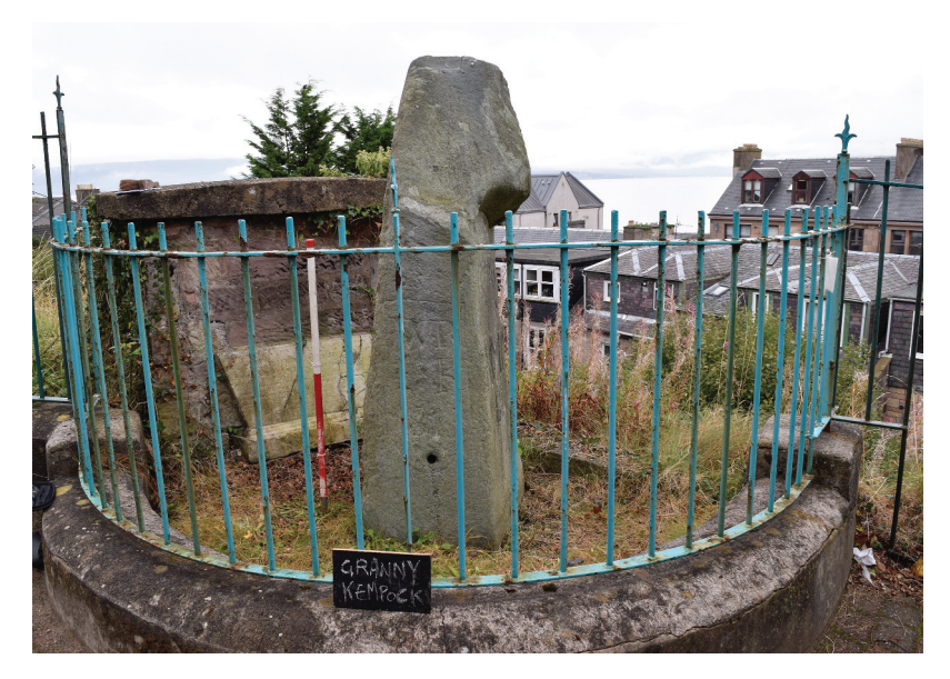
Figure 1. The Kempock Stone'.

assignation. Similarly, the brief description on the Canmore National Monuments Record of Scotland (Canmore, n.d.) details the petrology of the stone, its size and sketchy historical details but little else of archaeological significance. Never archaeologically explored, relocated to a museum or subject to authoritative categorisation, it remains enigmatic, stimulating manifold interpretations and practices. Unconfined by the expert narratives of heritage and the potted accounts of tourism, the stone endures as an important material icon of place. It has served as a prompt for storytelling, the subject for numerous filmic, literary and graphic narratives, and a site for a multitude of ritual and playful practices.