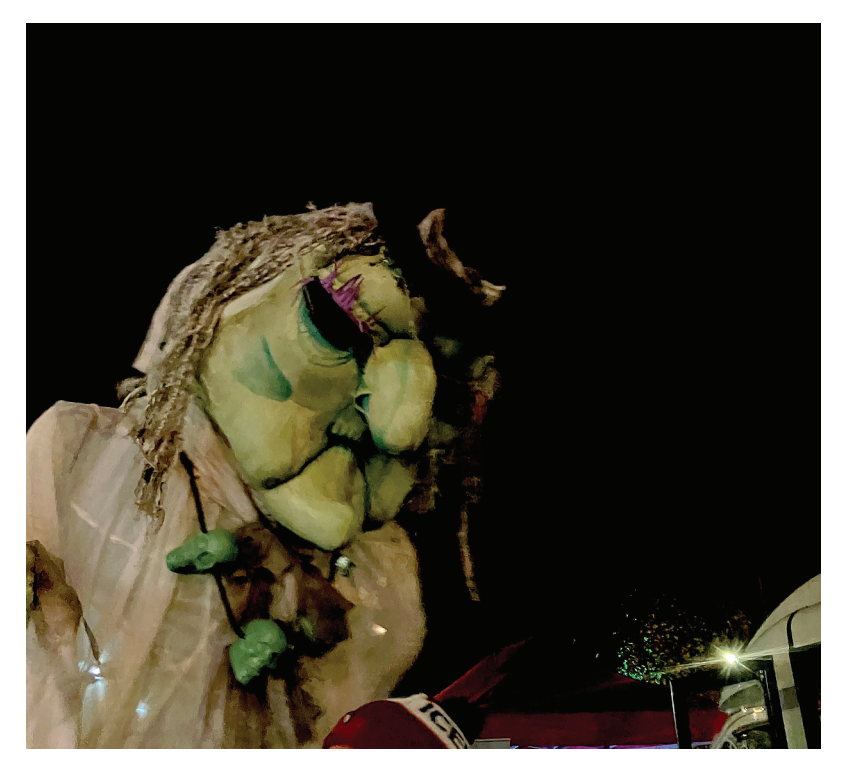
Figure 4. The Galoshans Granny Kempock puppet' here please.