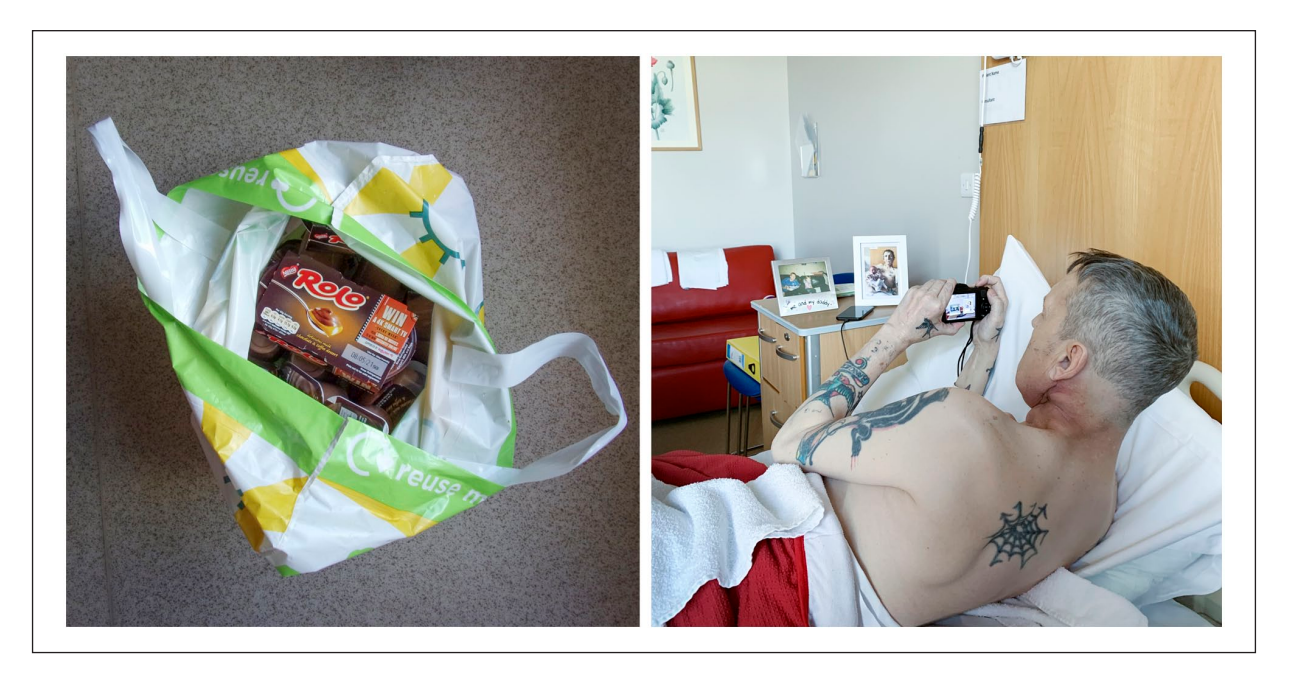
Figure 3. A participant shown taking photovoice images of a bag of chocolate puddings—the only thing he was able to eat—from his hospice bed. Left hand photograph ©Dying in the Margins 2021; right hand photograph ©Margaret Mitchell 2021 all rights reserved.