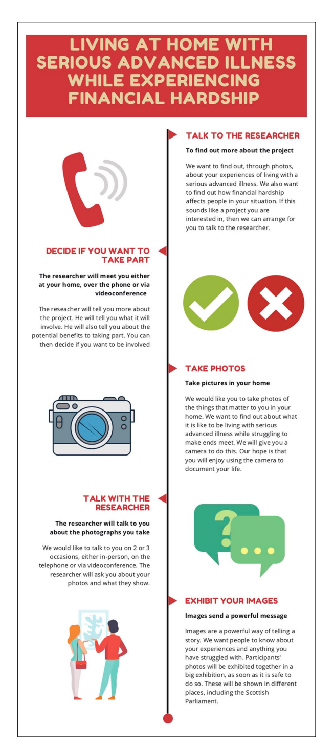
Figure 1. Visual flowchart showing the method used with potential participants and recruiters. © Dying in the Margins 2021 all rights reserved.

images in dissemination of the work. Consent to use both photovoice and professional images was agreed on an image-by-image basis during touchpoints. Copyright of the photovoice images belongs to the project, while Margaret Mitchell retains copyright of her images.