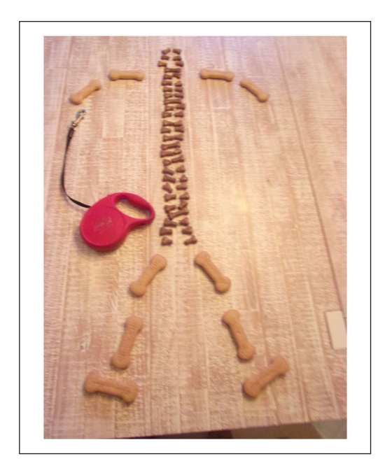
Figure 6. A participant's photovoice image representing how her arthritis and osteoporosis prevent her from walking her dog, one of her favourite pastimes.