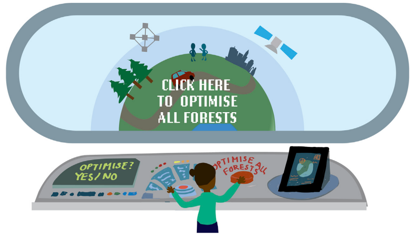
Figure 4. Digitalized environmental governance: Automating and optimizing specific ends