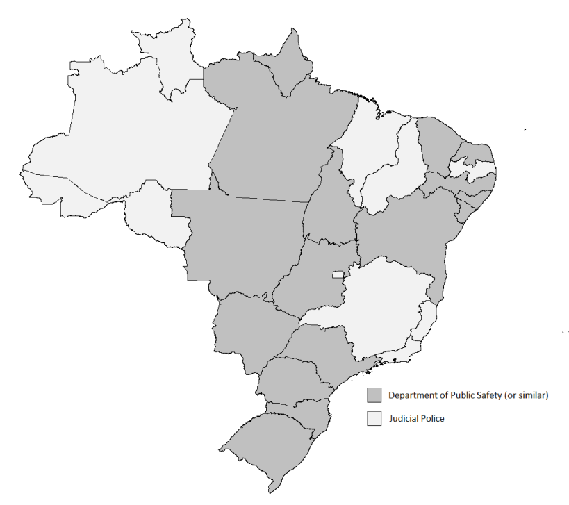
Figure 2: Organisation of Institutes involved in investigation of violent deaths in each Brazilian Federative State and the Federal District.

If the external lesions are adequate for the determination of the cause of death by the MLI, or if there is no crime to be investigated, the external postmortem examination alone may suffice for unnatural deaths. However, in general, full post-mortem examinations are undertaken. Post-mortem examinations can only be done after 6 hours of death, unless Forensic Experts are confident that it may be done earlier<sup>6</sup>.