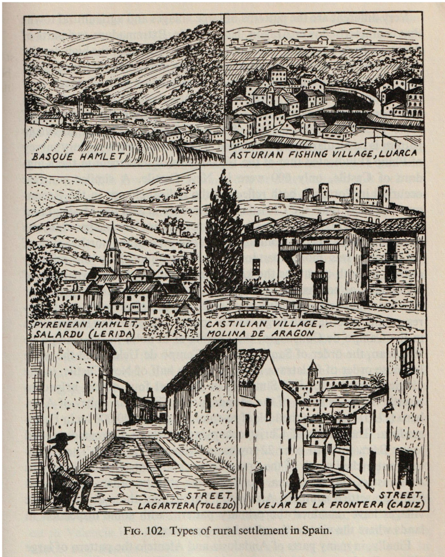
FIG. 102. Types of rural settlement in Spain.