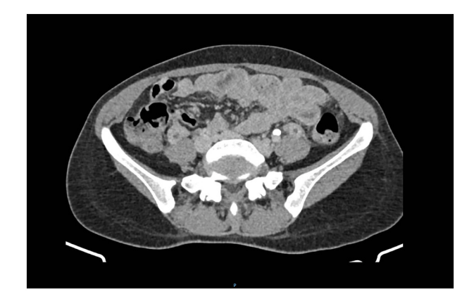
Fig. 2. The ovarian vein is thick-walled and enlarged, with central tubular hypodensity and rim enhancement, which is indicative of ovarian vein thrombosis.

In the past, OVT was treated with surgical ovarian vein ligation, which also served to prevent pulmonary embolism. The mortality rate decreases from 50% to 4.4% following ligation of the inferior vena cava and ovarian vein [4]. Currently, most cases of OVT are treated with drugs. The current Canadian guidelines advise the continuation of parenteral broad-spectrum antibiotics for a minimum of 48 h before defervescence and clinical improvement. In addition, therapeutic-dose anticoagulation may be considered for 1 to 3 months [10]. However, these recommendations are based solely on clinical experience and expert opinion; the effect of anticoagulants on patients with OVT is the