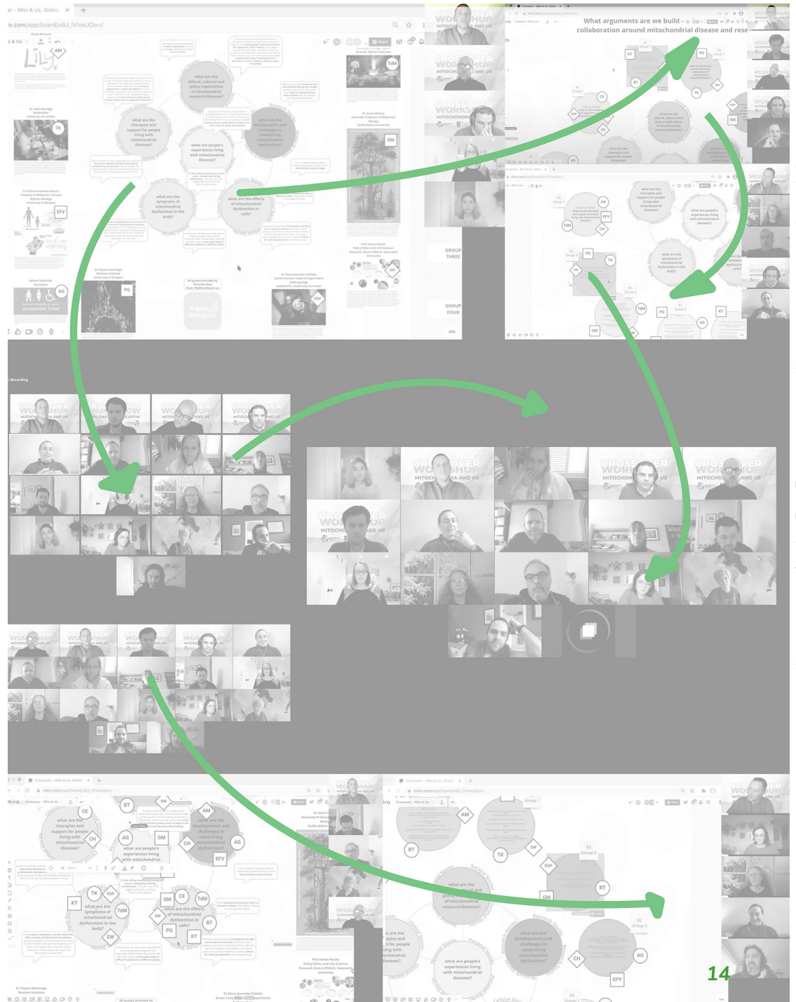
Figure 4. Mitochondria and Us workshop, brainstorming Session

with mitochondrial disease) participated in a webinar discussing mitochondrial dysfunction in relation to bipolar disorder; afterward, she contacted professor Andrezza to ask if these two diseases were linked and, if so, how. Enquiries like these, and growing support in the literature, led to the creation of MITO2i – a network of researchers, clinicians, patient