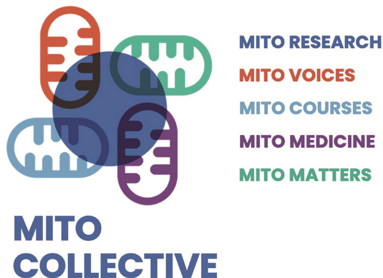
Figure 5. The Mito Collective initiative uniting research and community voices and bringing mitochondrial and metabolism to the forefront of medicine

MITO VOICES – to share experiences of those affected by or working with mitochondria