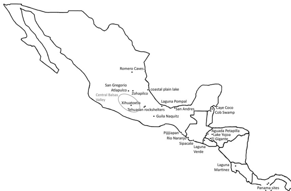
Figure 1. Mexico and Central America, showing sites where early maize finds document its spread from the Balsas Valley of southwest Mexico to Panama over the course of about a thousand years.