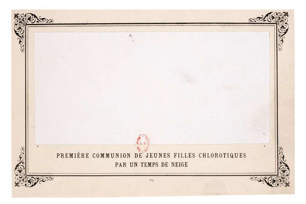
Figure 1. Alphonse Allais, 'Première Communion de jeunes filles chlorotiques par un temps de neige'. Album Primo-Avrilesque (Paris: Paul Ollendorff, 1897), p. 1.

Allais's forays into the monochrome have one significant precedent, in the form of an entirely black canvas with the title 'Combat de Nègres dans un tunnel' displayed by Paul Bilhaud at the 1882 exhibition. The Album Primo-Avrilesque itself features a 'Combat de Nègres dans une cave, pendant la nuit' and in the preface to the volume, a note alludes to Bilhaud's image, stating it is reproduced 'avec la permission spéciale des héritiers de l'auteur' (1897, 1). Playful though Allais's Album might wish to be, the racist trope that underlies this part of it deserves interrogation, even if just in passing here. As James Smalls has argued regarding the trope of 'Combats de nègres dans un tunnel', this kind of trope masks modernism's debt to black culture, and through it, Smalls notes, 'blackness as a potentially explosive racial matter has been defused and conveniently subsumed within the rhetorical sanctuary of a (white) modernist thinking and practice' (2014, 148-49). A full understanding of the blank's link to the colour white in the rhetoric of modernism, then, needs to acknowledge its relation to other chromatic values in ways that may disclose or enable, as in this case, forms of racial prejudice.