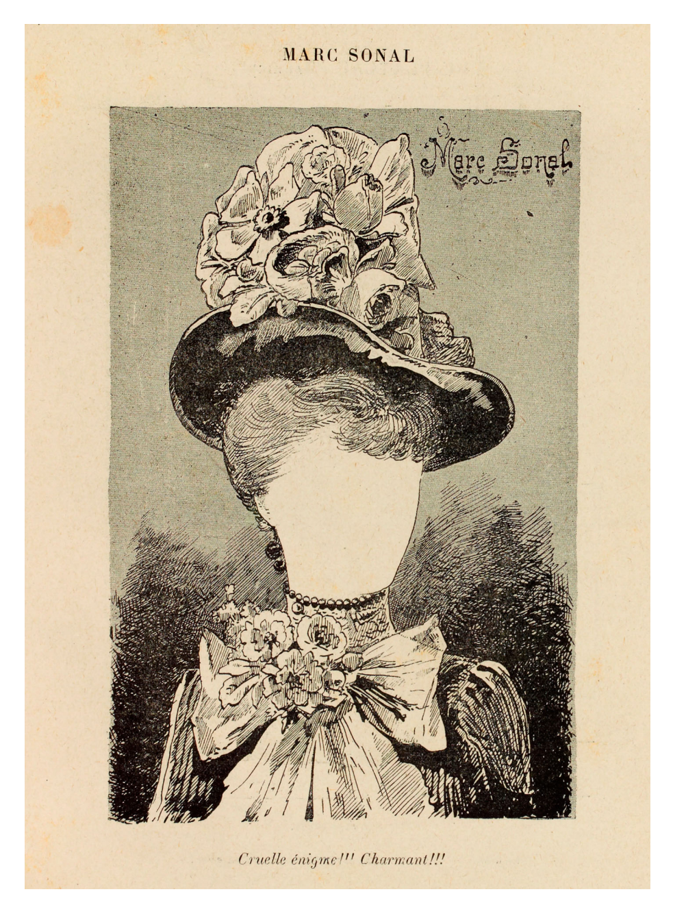
Figure 3. Marc Sonal, Cruelle énigme!!! Charmant!!! in Exposition des arts incohérents: catalogue illustré 1886 (Paris: Imprimerie Georges Chamerot, 1886), p. 44.

'depth' as a value. In comparable fashion, Amédée Marandet's 1884 'Portrait sans pieds d'un sociétaire de la Comédie-Française' shows nothing more of its subject than his torso and throat, placing the face outside the frame altogether (1884, 76-77).