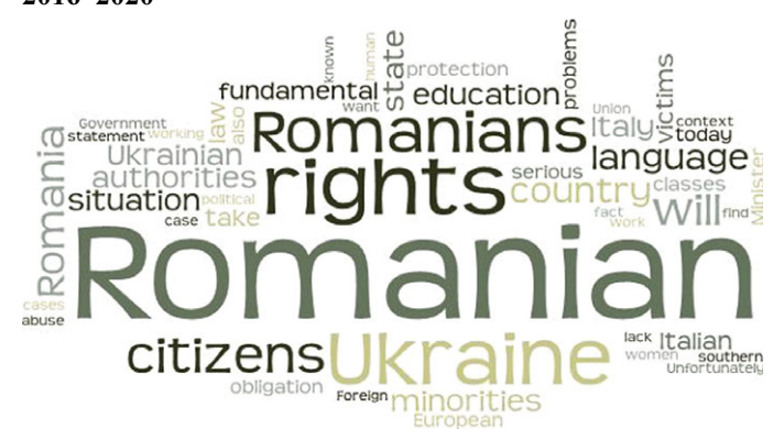
Appendix 2: Word Clouds for the Legislative Speeches per Term in Office 2008–2012