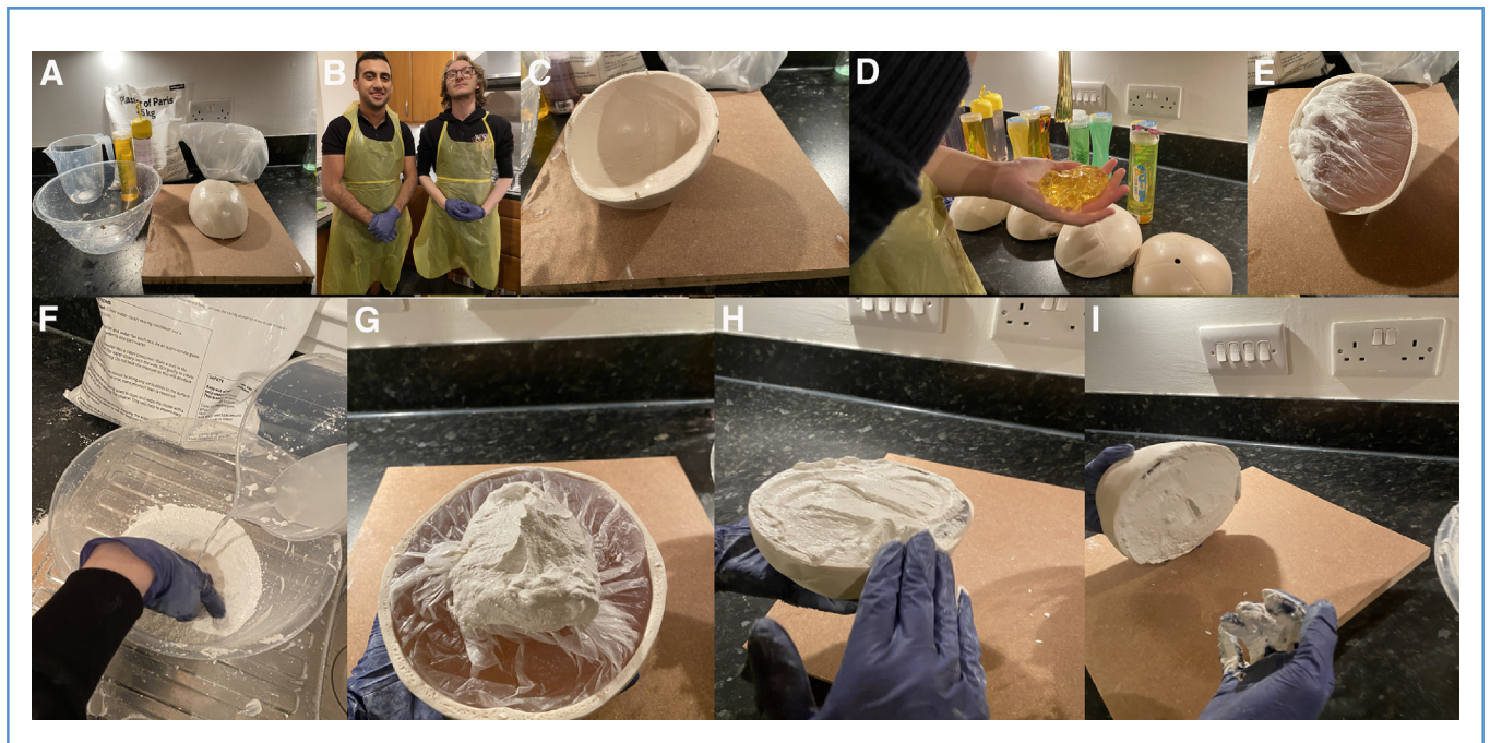
Figure 1. Procedure for building a single skull model.

Plaster of Paris should be made into paste form per the manufacturer's instructions in a plastic bowl using water. Caution needs to be exercised, and manufacture instructions should be diligently followed. Initially, when water is first