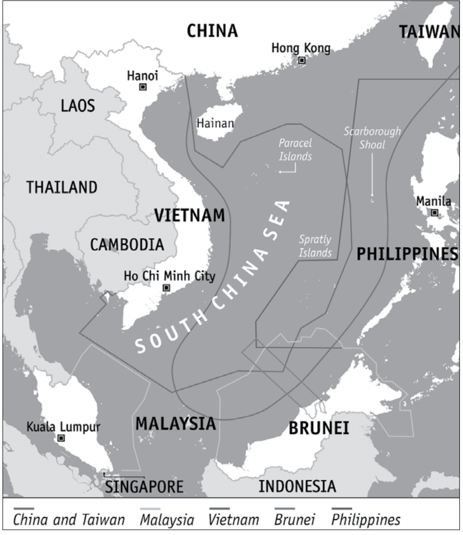
Map 1. Competing claims in the South China Sea