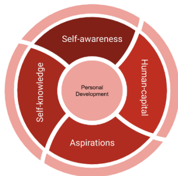
Fig. 2. Elements to buildup personal development.

Self-awareness [15], self-knowledge [16], human-capital [17], and aspirations [18] are some of the vital elements in the personal development theory (Fig. 2) related to the industrial program, leading to the success of building a student's career. During the self-confidence formation process: identity and leadership skills can be grown through the role mode effect. A fresh trainee needs a good mentor to teach them how to lead a team in a workplace [19]-[21] and how the job can be done, etc. Without a good mentor, some intangible knowledge cannot be easily inherited to the next generation. This is also how the self-image formation can be achieved in certain professional industry, such as wearing a uniform required by some occupations [22].